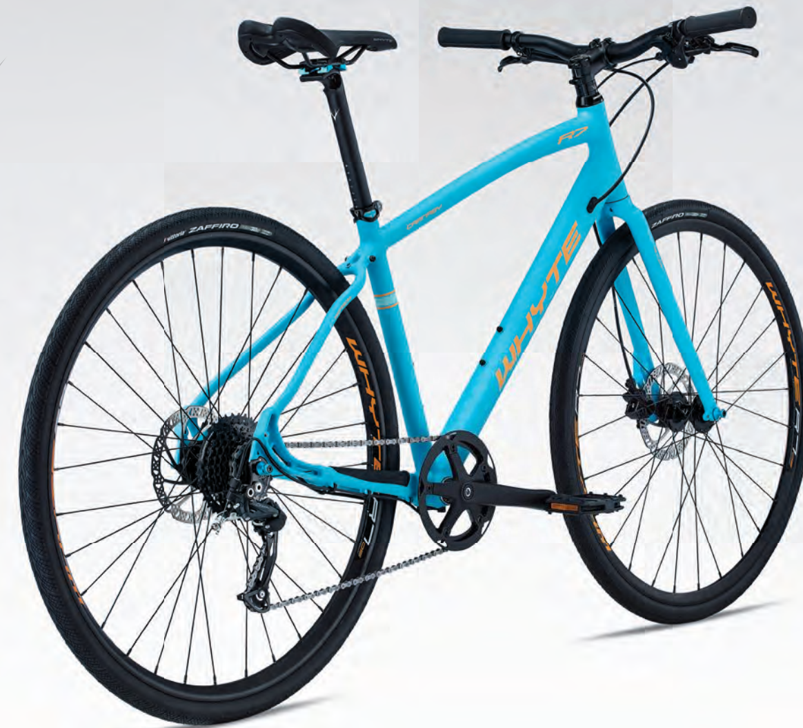
Lightweight aluminium frame with compact geometry / Tektro hydraulic disc brakes / Vittoria 32c Tyres / 1x9spd Shimano drivetrain for urban simplicity FAST URBAN/COMMUTER - R7 SERIES