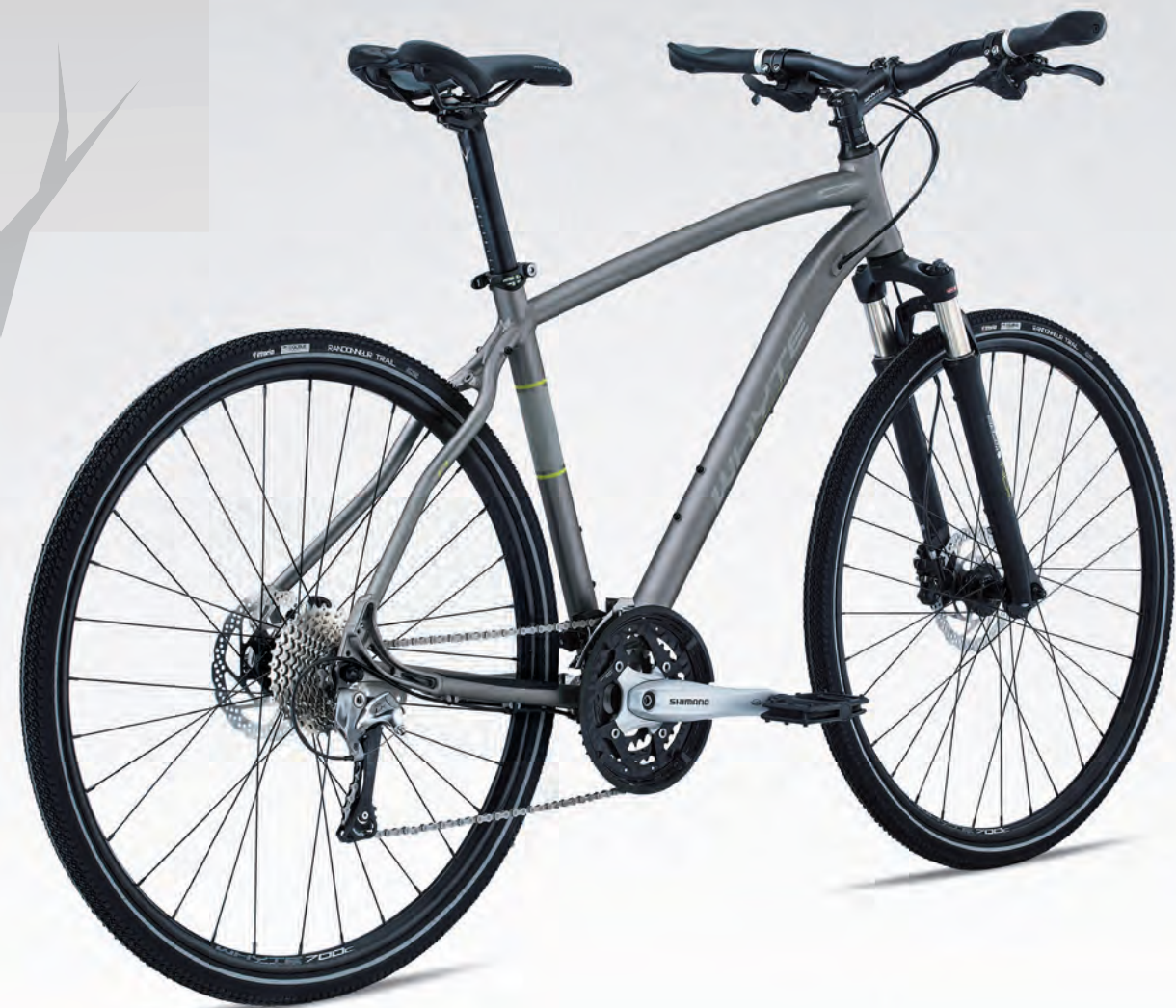
Lightweight aluminium frame / Integrated Kickstand / Wide-ratio 3x10spd Shimano Deore LX gearing / Vittoria Randonneur 35c Trail tyres with double puncture protection ALL TERRAIN/LEISURE - C7 SERIES