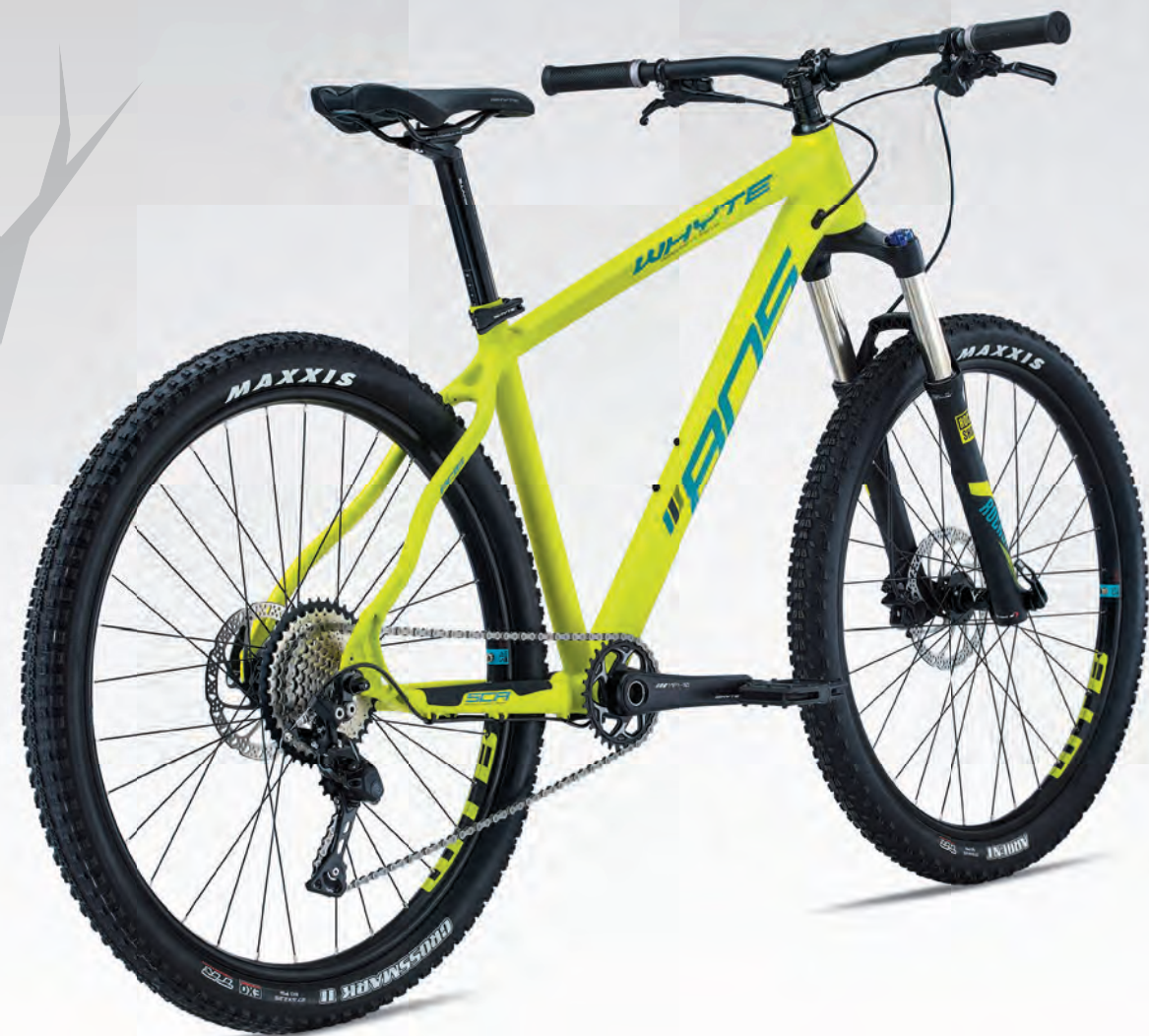
Tubeless Ready rims and Tyres / Shimano Deore 1 by 10 Drive-train / RockShox Recon Silver fork with TurnKey lockout and 15mm Boost Maxle TRAIL HARDTAIL - 800 SERIES - 120MM