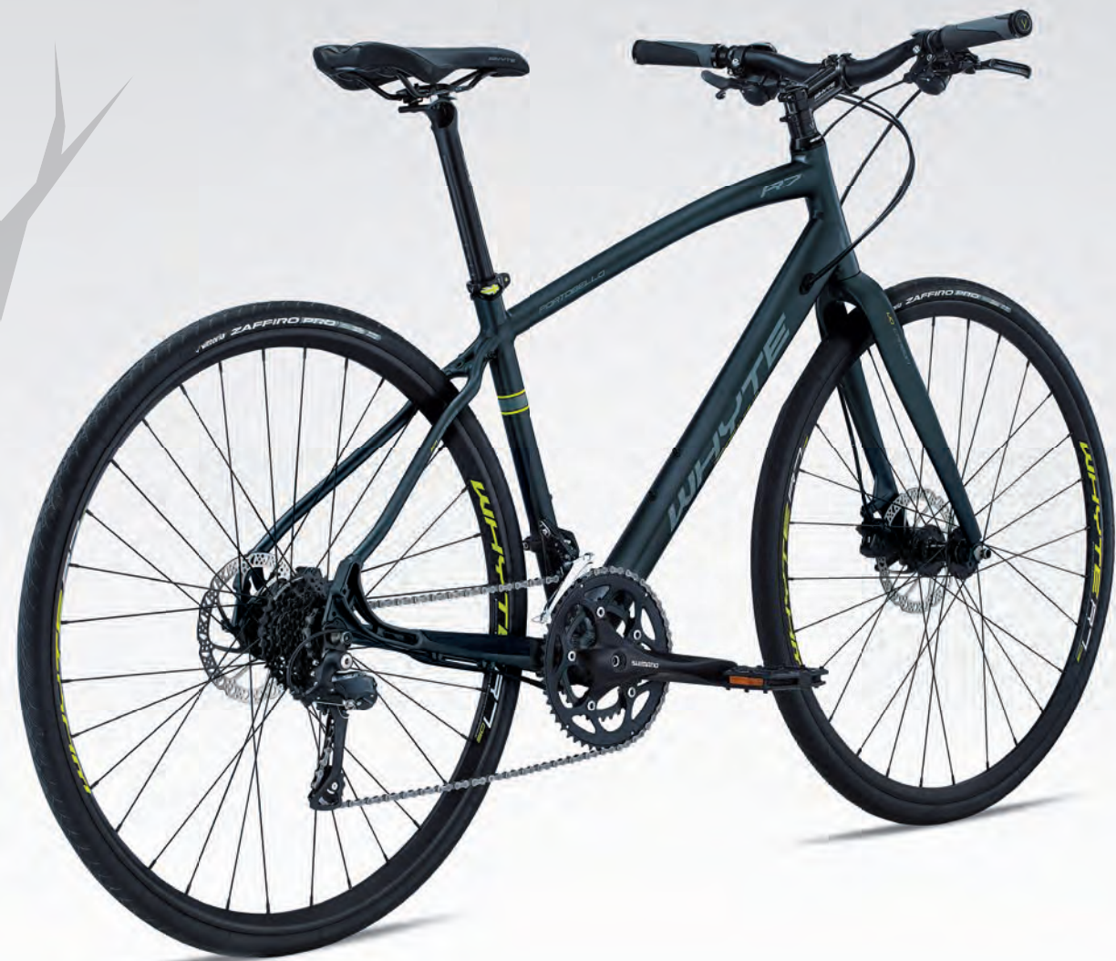
Lightweight aluminium frame with carbon fibre fork / Shimano 2x9spd drivetrain / Vittoria Zaffiro Pro 32c with puncture protection FAST URBAN/COMMUTER - R7 SERIES