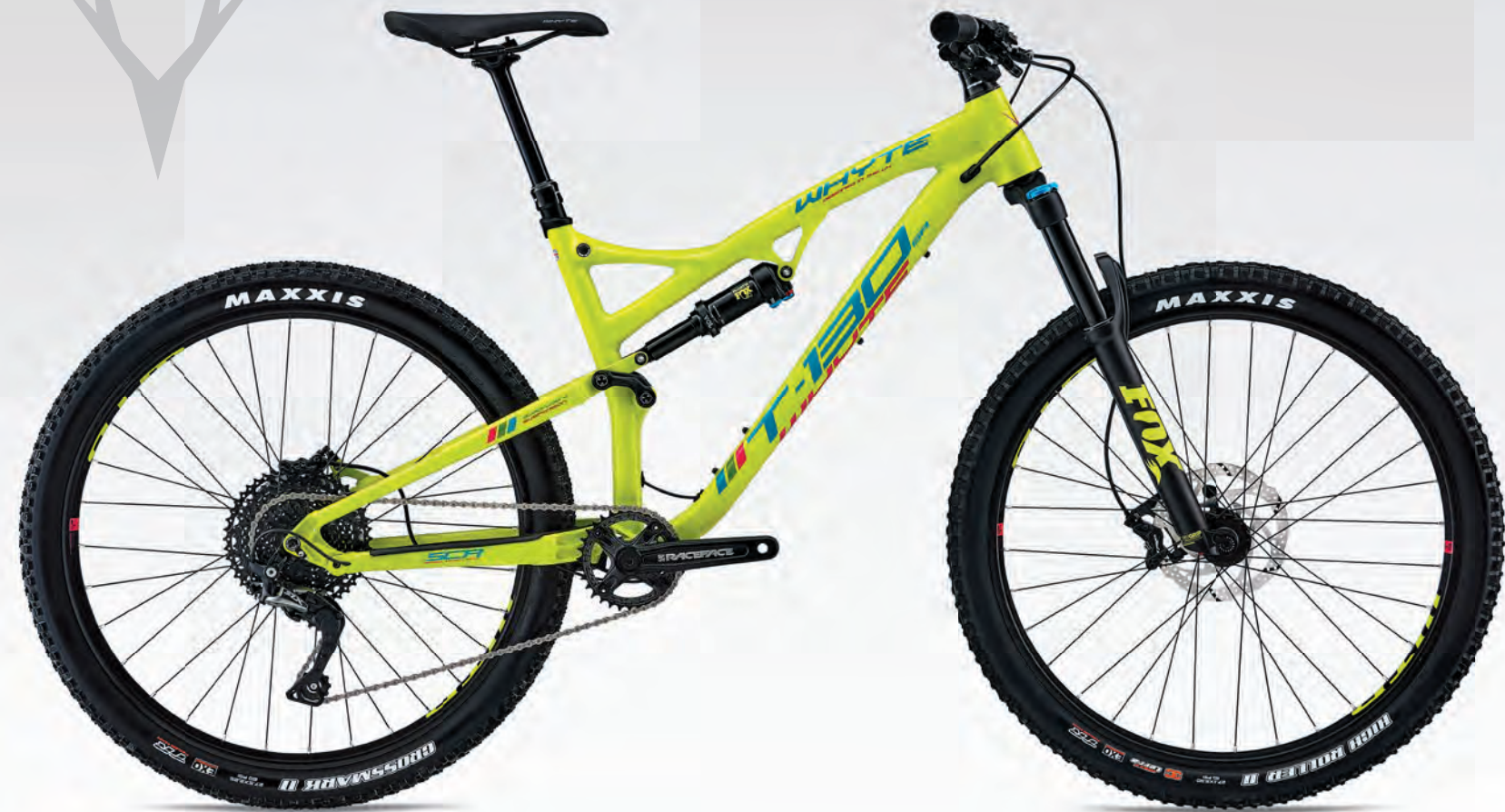
Fox Rhythm 34 front fork and Fox DPS rear shock / Shimano SLX/RaceFace 1 by 11 drivetrain / Whyte Drop.it Dropper Post T-130 TRAIL SUSPENSION - 130MM