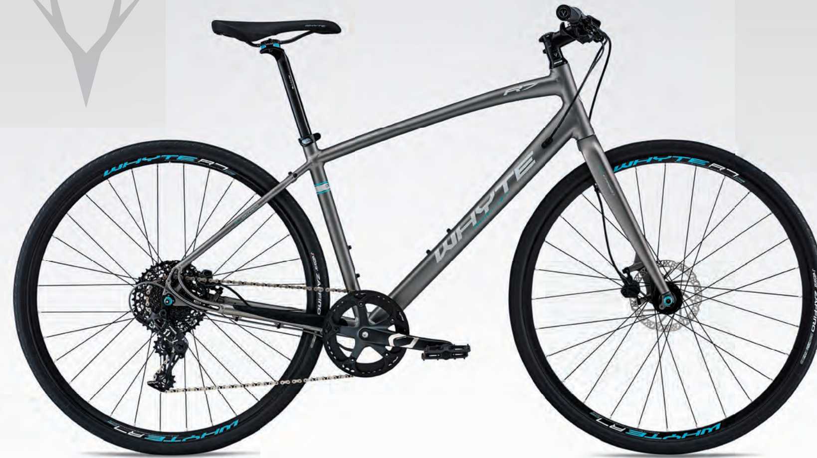
Carbon fibre fork with lightweight aluminium steerer tube / Lightweight aluminium frame / SRAMs Apex 1, 1 by 11spd urban drivetrain FAST URBAN/COMMUTER - R7 SERIES