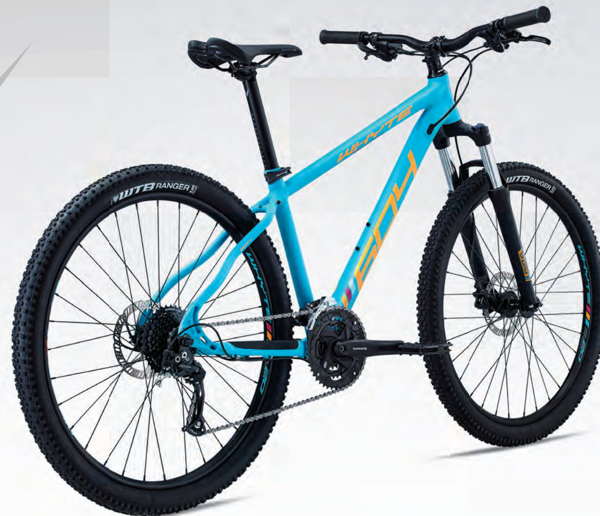
Lightweight aluminium frame with compact geometry for smaller riders / Internal cable routing / SR Suntour suspension with 100mm Travel and lockout feature / 2.25 WTB Ranger Tyres SPORTS HARDTAIL - 600 SERIES - 100MM