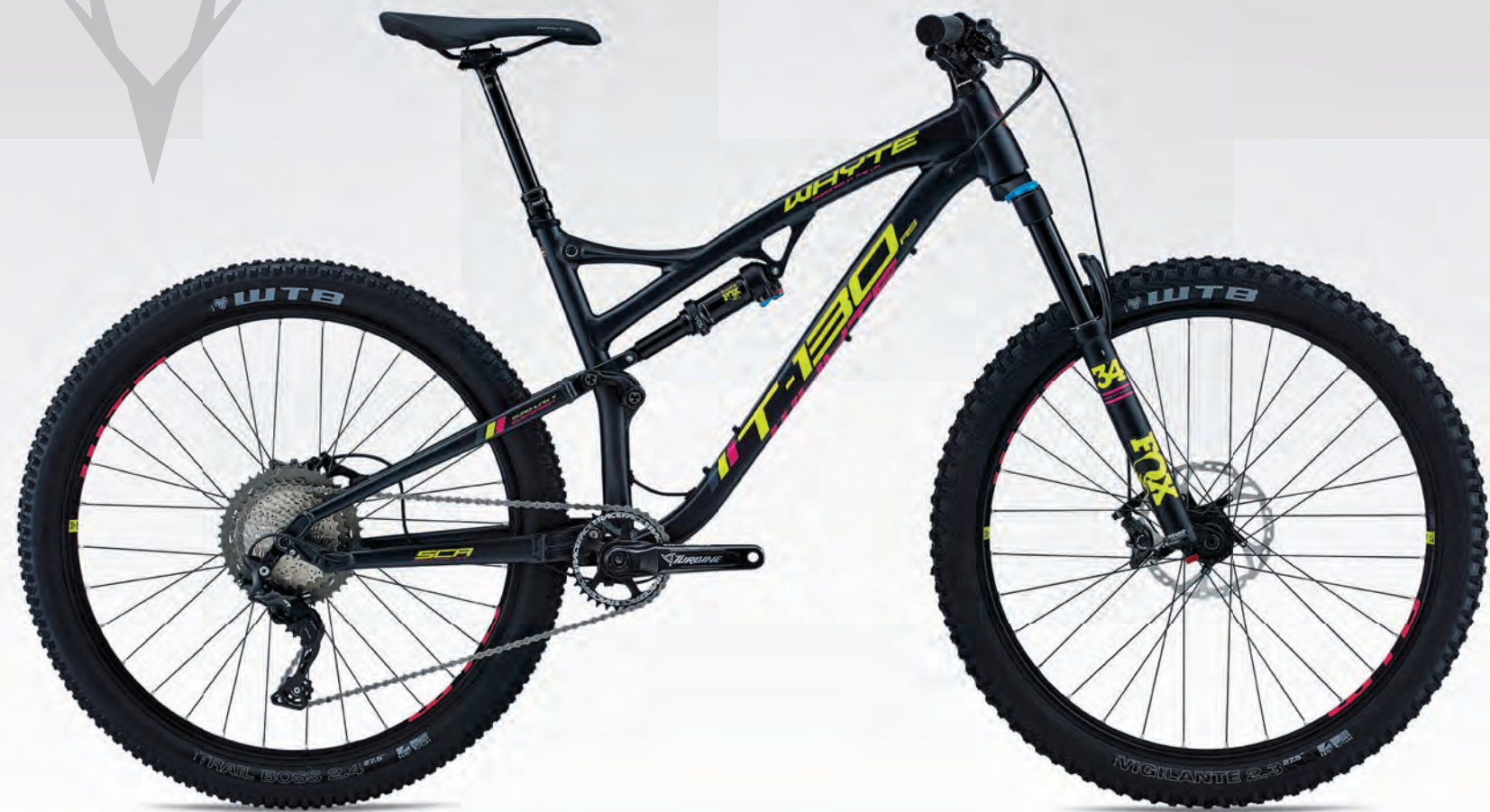
Shimano XT 11 by 11 drivetrain / FOX 34 Performance Elite fork with Float DPS rear suspension/ Reverb Stealth seatpost T-130 TRAIL SUSPENSION - 130MM