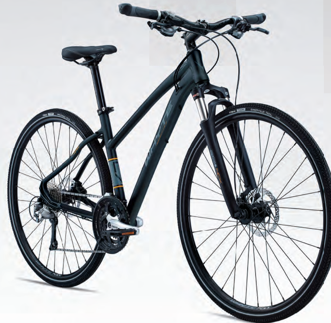
Lightweight aluminium frame / Integrated Kickstand / Wide-ratio 3x10spd Shimano Deore LX gearing / Vittoria Randonneur 35c Trail tyres with double puncture protection ALL TERRAIN/LEISURE - C7 SERIES