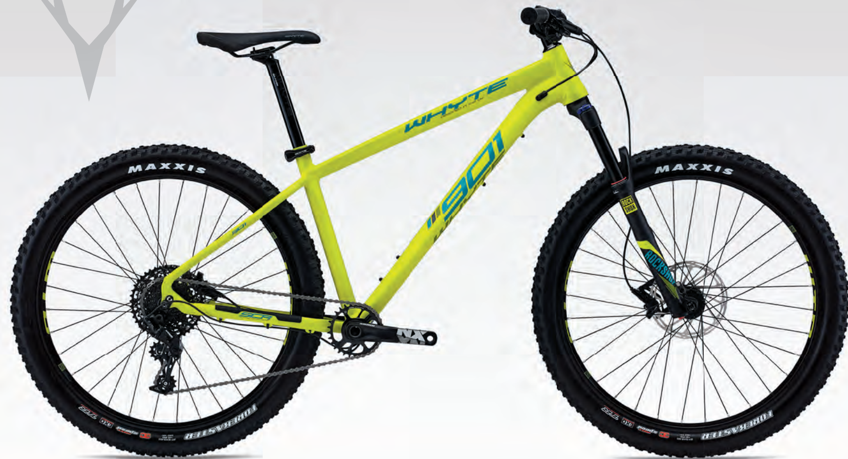
Lightweight and stiff 6061 aluminium frame / RockShox Recon Gold RL fork / Whyte custom 760mm bar and size specific stem / WTB TCS rims and 2.6" Maxxis Forekaster tyres TRAIL/ENDURO HARDTAIL - 900 SERIES - 130MM