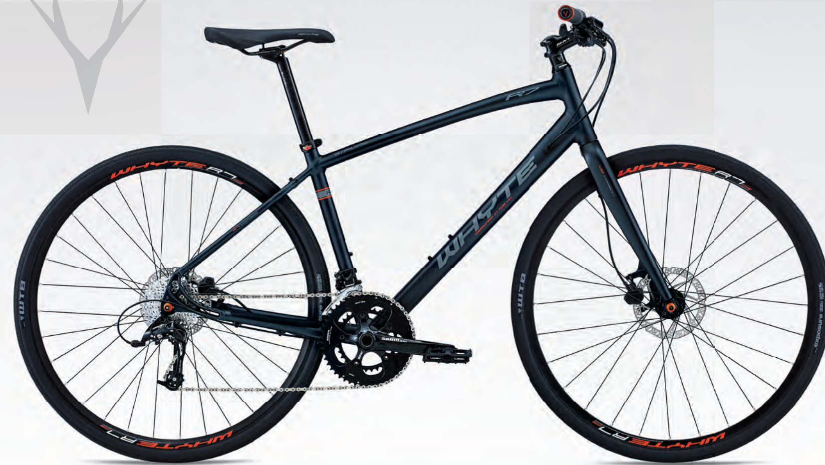
SRAM X5/Via groupset / lightweight aluminium frame and carbon fibre fork / Powerful Tektro hydraulic disc brakes FAST URBAN/COMMUTER - R7 SERIES