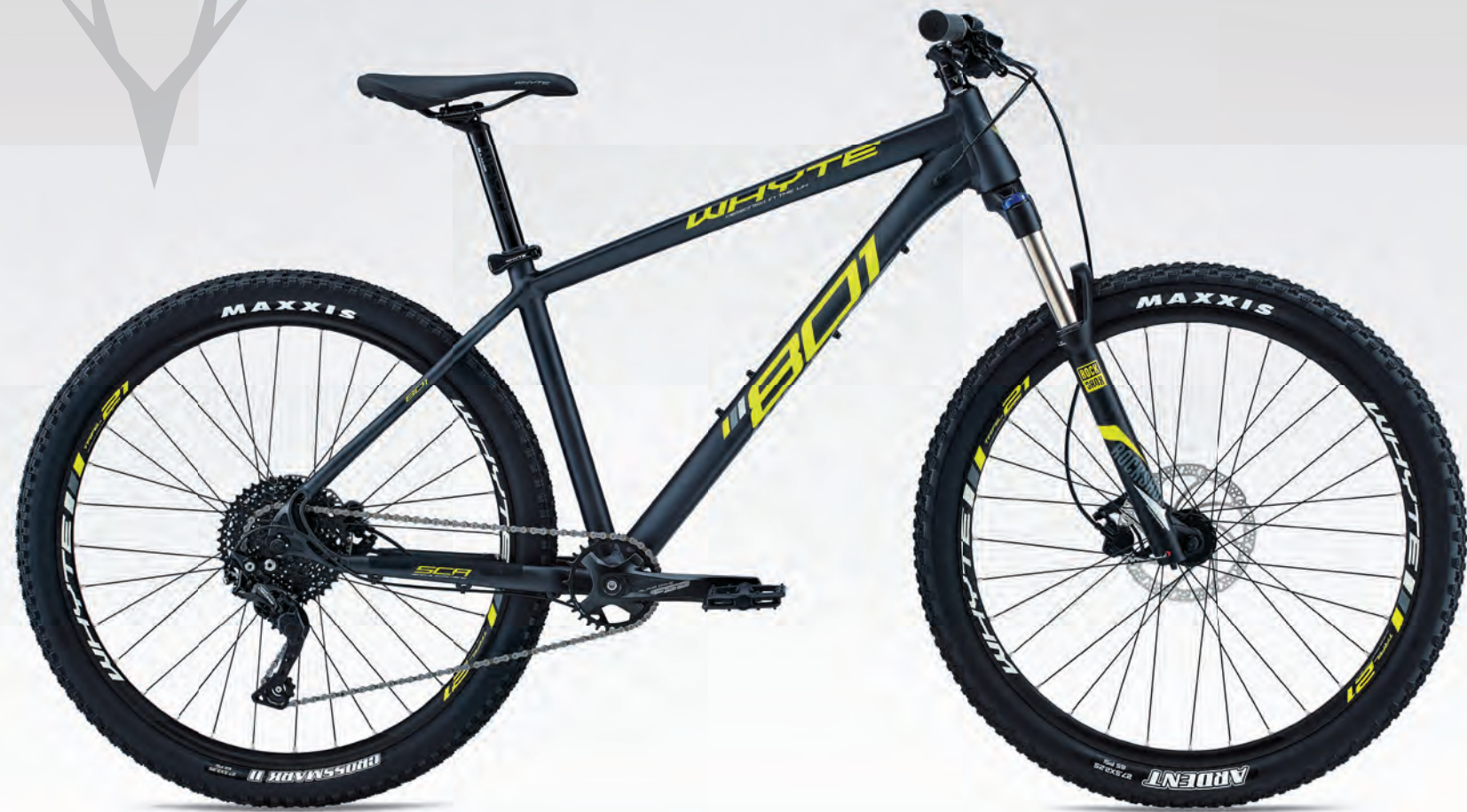
Shimano Deore/ Sunrace wide range cassette 11-42 / Maxxis front and rear specific tyres / RockShox 120mm 30 Silver fork with TurnKey lockout and Solo Air TRAIL HARDTAIL - 800 SERIES - 120MM