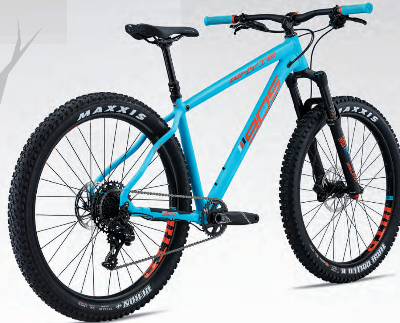
RockShox Revelation RC fork / Internally routed Whyte Drop.it Seat Post / Whyte custom 760mm bar and short gravity stem/ Maxxis front and rear specific 2.8" TR tyres and WTB STp i35, 35mm wide rims TRAIL/ENDURO HARDTAIL - 900 SERIES - 130MM