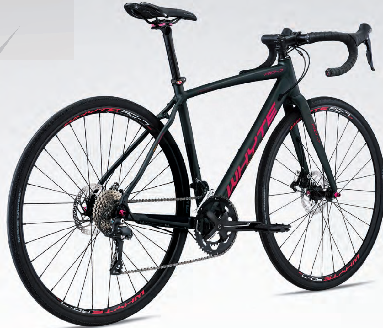
Compact Geometry Disc-specific aluminium frame with carbon fibre fork / TRP HyRd mechanical/hydraulic disc brakes / Shimano Sora 9spd super compact gearing with wide range rear cassette SPORTS ROAD/COMMUTER DISC - RD7 SERIES