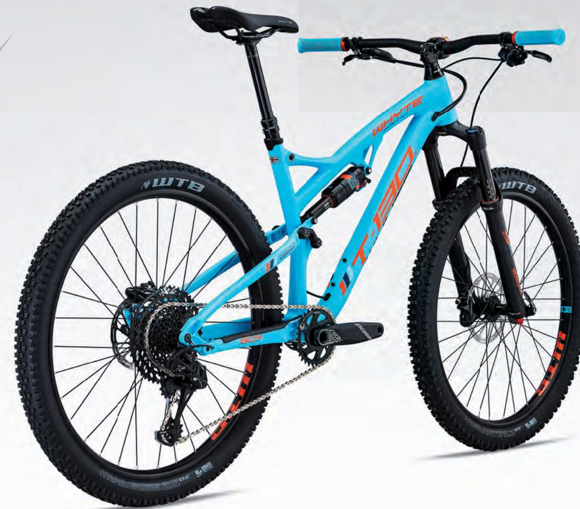
RockShox Revelation RC fork, Monarch DebonAir shock / SRAM GX Eagle Groupset / Stealth Reverb / Whyte handlebars / WTB STs i29 29mm TCS sleeved rims T-130 TRAIL SUSPENSION - 130MM