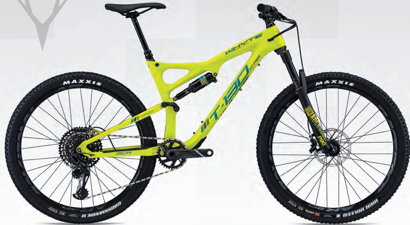
SRAM GX Eagle 12-speed drivetrain / RockShox Pike Boost fork, Monarch DebonAir shock and Reverb Stealth seatpost T-130 TRAIL SUSPENSION - 130MM