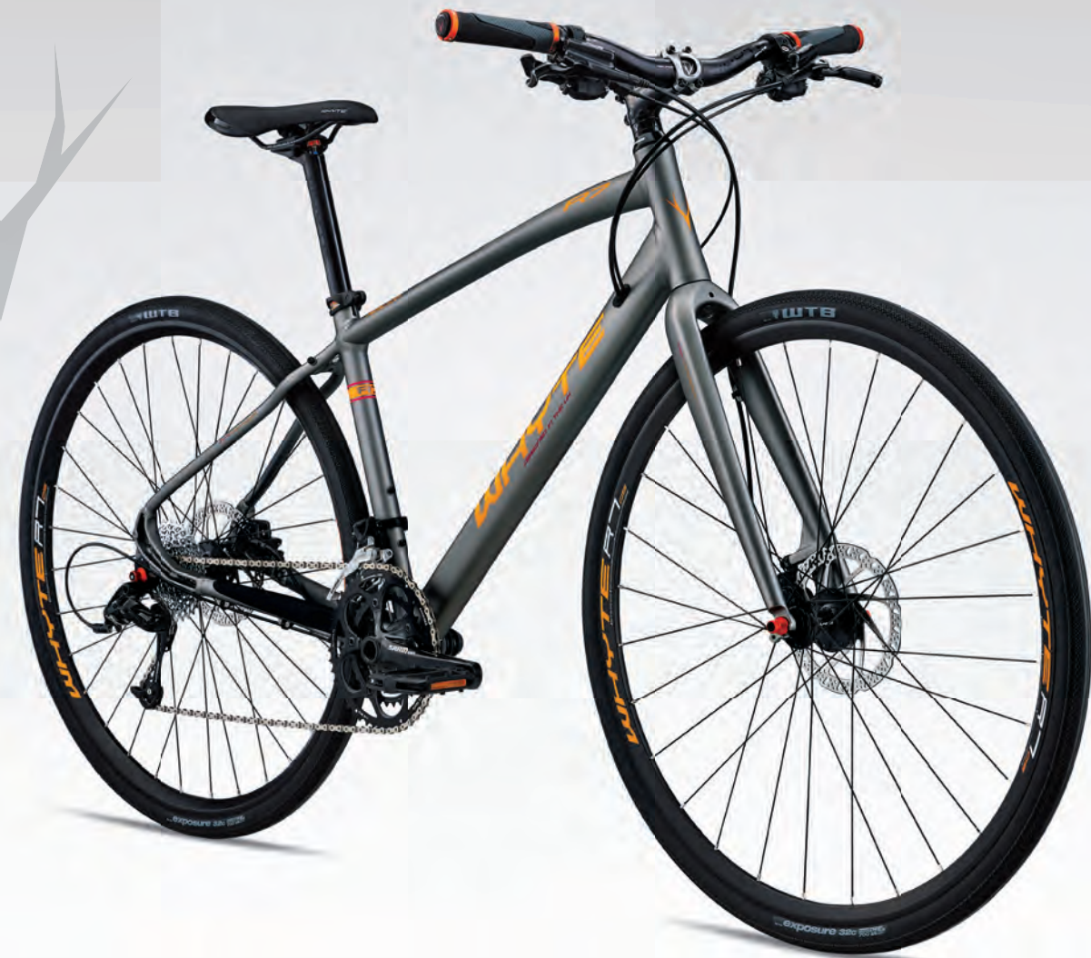
Lightweight aluminium frame with compact geometry / Carbon fibre fork with alloy steerer tube / SRAM 2x10spd compact gearing / Tektro hydraulic disc brakes FAST URBAN/COMMUTER - R7 SERIES