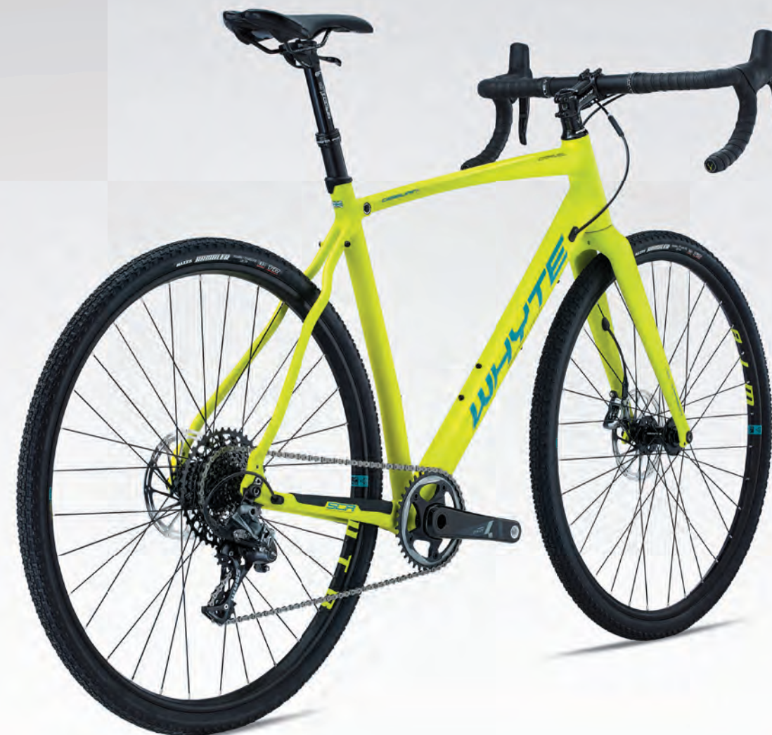
SRAM Force 1 1x11spd drivetrain and hydraulic disc brakes / WTB Asym i23 TCS rims with Maxxis TR Rambler tyres 700 X 40c / KS Speed Up dropper post GRAVEL/ADVENTURE - GX SERIES