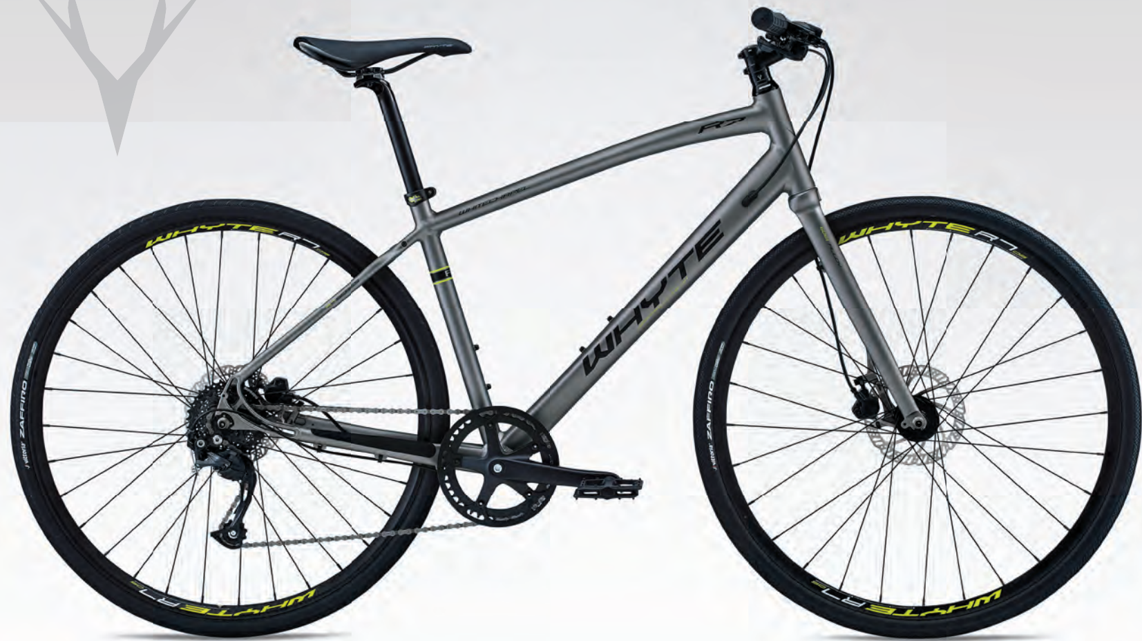
Lightweight aluminium frame / Tektro hydraulic disc brakes / Vittoria 32c Tyres / 1x9spd Shimano drivetrain / for urban simplicity FAST URBAN/COMMUTER - R7 SERIES