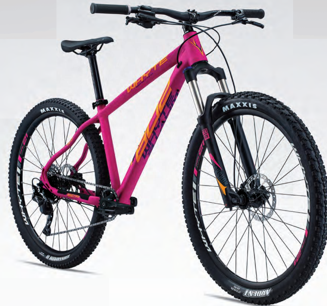
Compact geometry for riders with smaller proportions / Available in size XS / Deore/Sunrace wide range 11-42 cassette / Lightweight hydro formed aluminium frame TRAIL HARDTAIL - 800 SERIES - 120MM