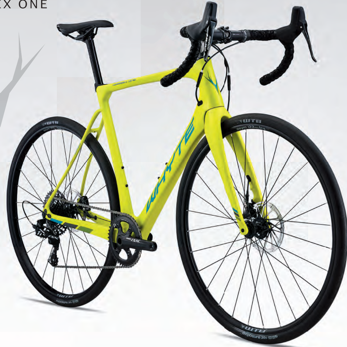
SRAM Apex flat mount disc brakes / WTB Exposure 30c TCS Tubeless Ready tyres / WTB Asym i23 TCS, Tubeless ready rims/ SRAM APEX 1 wide range drive-train CARBON PERFORMANCE ROAD - RDC7 SERIES