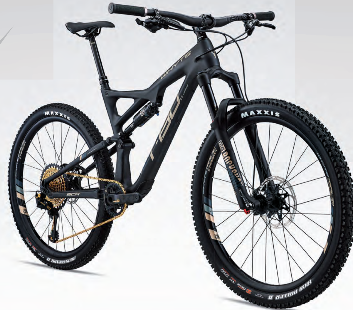
SRAM XX1 Eagle Gold 12-speed drive-train / Rockshox suspension and Reverb Stealth seatpost with X1 Remote T-130 TRAIL SUSPENSION - 130MM