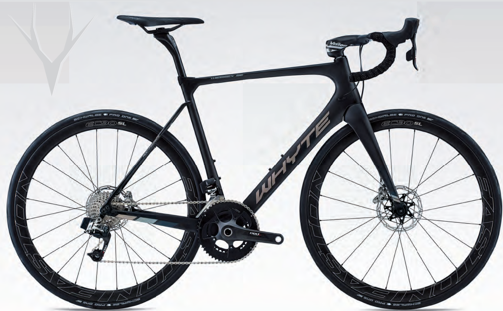
SRAM Red eTap Wireless / Schwalbe Pro-One tubeless ready 28c tyres / Easton EC-90 SL 19mm Tubeless ready rims/ FSA Metron 1pcs aero bar with internal hose routing CARBON PERFORMANCE ROAD - RDC7 SERIES