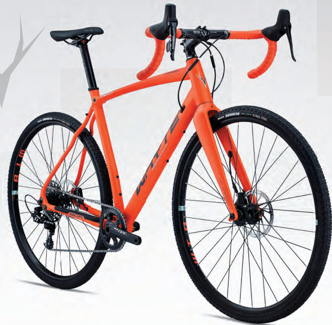
SRAM APEX 1 hydraulic disc brakes / SRAM APEX 1, Long Cage, 11 Speed / WTB tubeless ready rims and Maxxis Rambler 40c tyres GRAVEL/ADVENTURE - GX SERIES