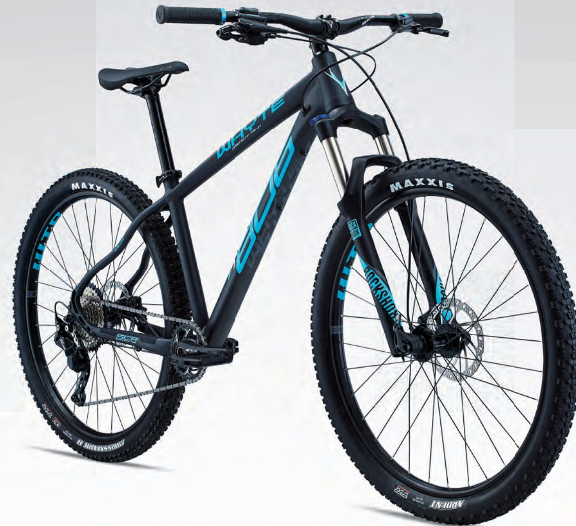
Shimano Deore M6000 1 by 10 drive-train / Compact geometry and sizing down to XS for smaller riders / Adjustable air-sprung RockShox Judy TK suspension fork TRAIL HARDTAIL - 800 SERIES - 120MM