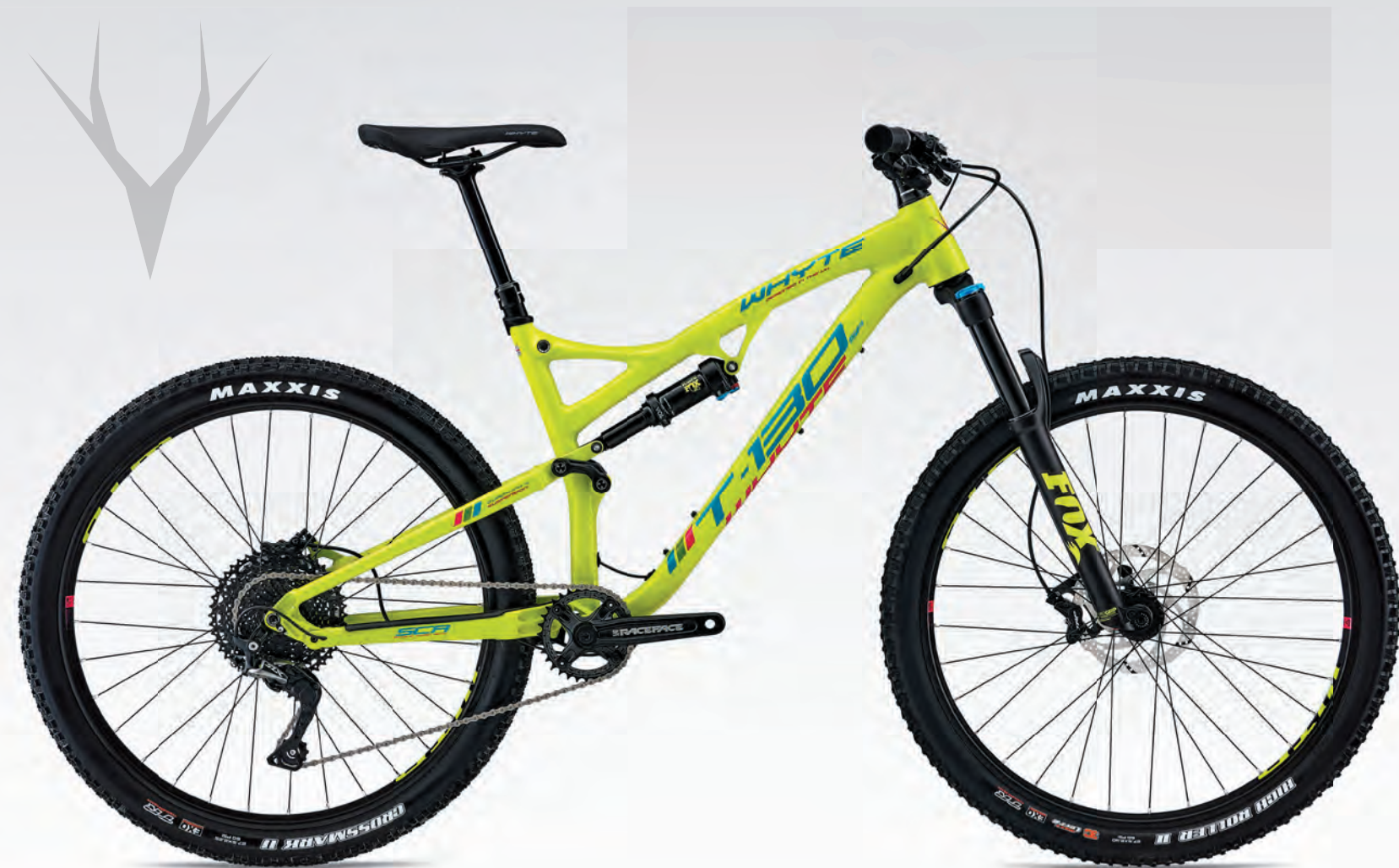
Fox Rhythm 34 front fork and Fox DPS rear shock / Shimano SLX/RaceFace 1 by 11 drivetrain / Whyte Drop.it Dropper Post T-130 TRAIL SUSPENSION - 130MM