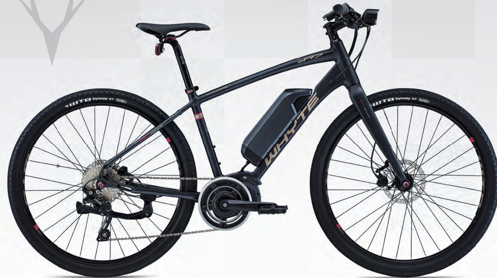
Shimano STEPS motor system / RoadPLUS tyres / Integrated Hermanns lighting system / up to 77 mile range in Eco mode / Compact Geometry FAST URBAN/COMMUTER STEPS E-BIKE - ER7 SERIES