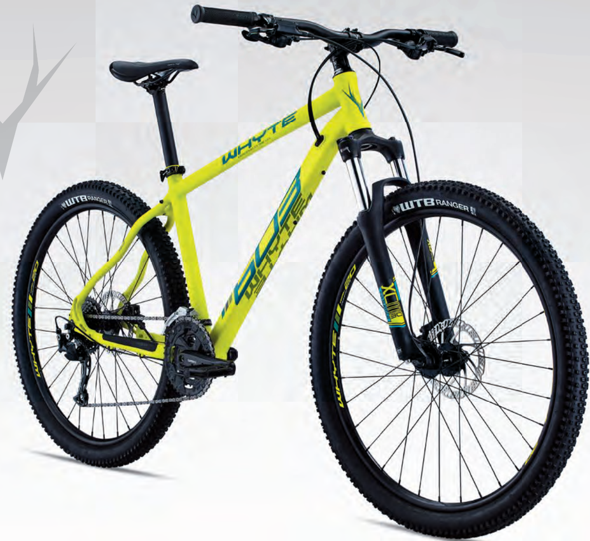
Lightweight aluminium frame with internal cable routing / SR Suntour suspension with 100mm Travel and lockout feature / 740mm Wide Bar / 2.25 WTB Ranger Tyres SPORTS HARDTAIL - 600 SERIES - 100MM