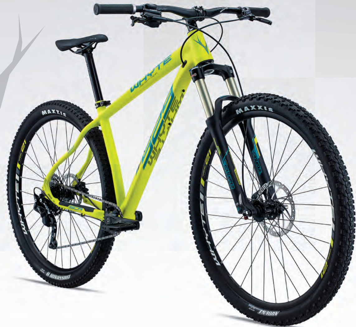
6061 Hydro Formed T6 Aluminium frame / Maxxis front and rear specific tyres / Shimano Deore with Sunrace 10-42 wide range cassette / SR Suntour Raidon front fork with 15mm through axle TRAIL HARDTAIL 29ER - 120MM