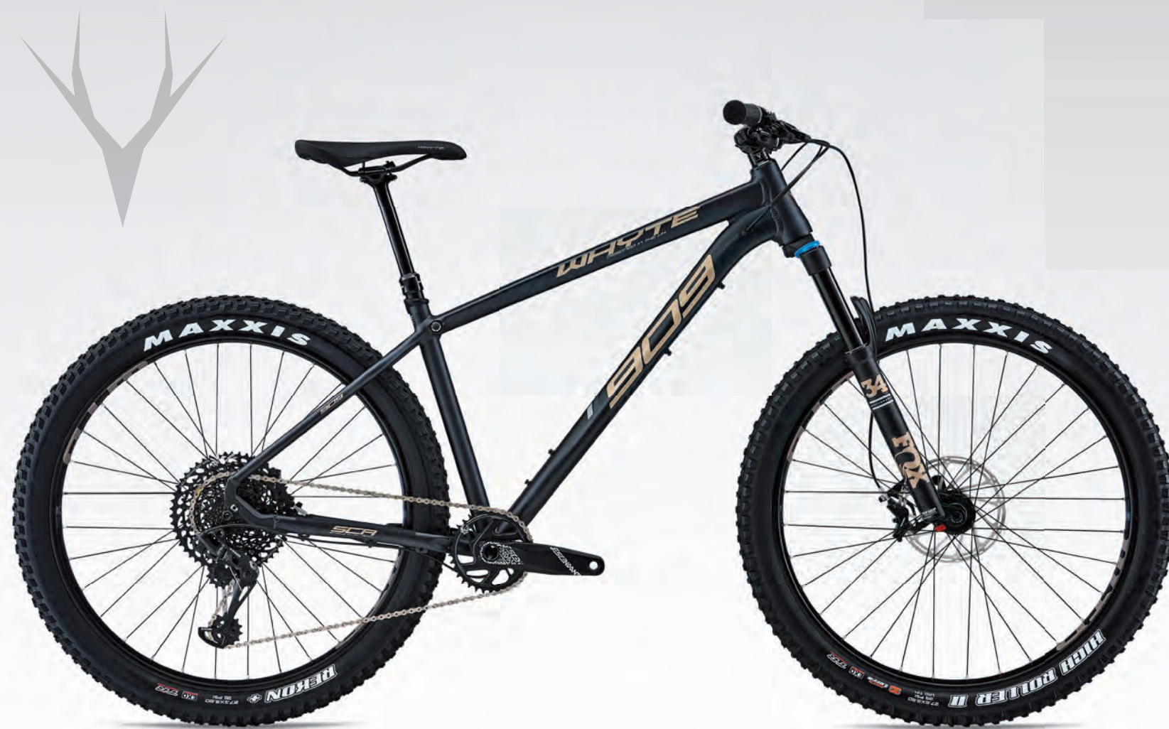
SRAM GX Eagle 12 speed drivetrain/ Hope PRO4 Boost rear hub with XD Driver / Fox 34 Performance fork with GRIP Damper TRAIL/ENDURO HARDTAIL - 900 SERIES - 130MM