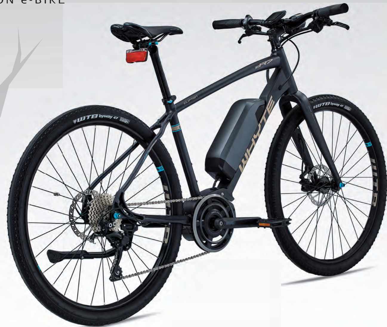
Shimano STEPS motor system / RoadPLUS tyres / Integrated Hermanns lighting system / up to 77 mile range in Eco mode FAST URBAN/COMMUTER STEPS E-BIKE - ER7 SERIES