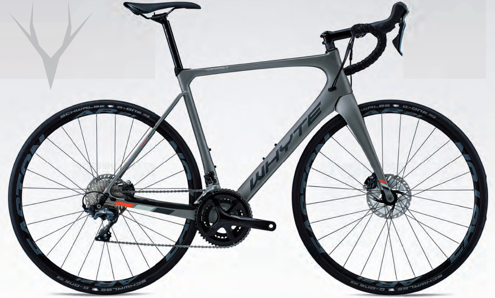
Shimano Ultegra flat mount disc brakes / Schwalbe G-One Speed tubeless ready tyres / Easton AR 21 Tubeless ready rims/ Shimano 105 wide range rear cassette / Full internal cable routing CARBON PERFORMANCE ROAD - RDC7 SERIES