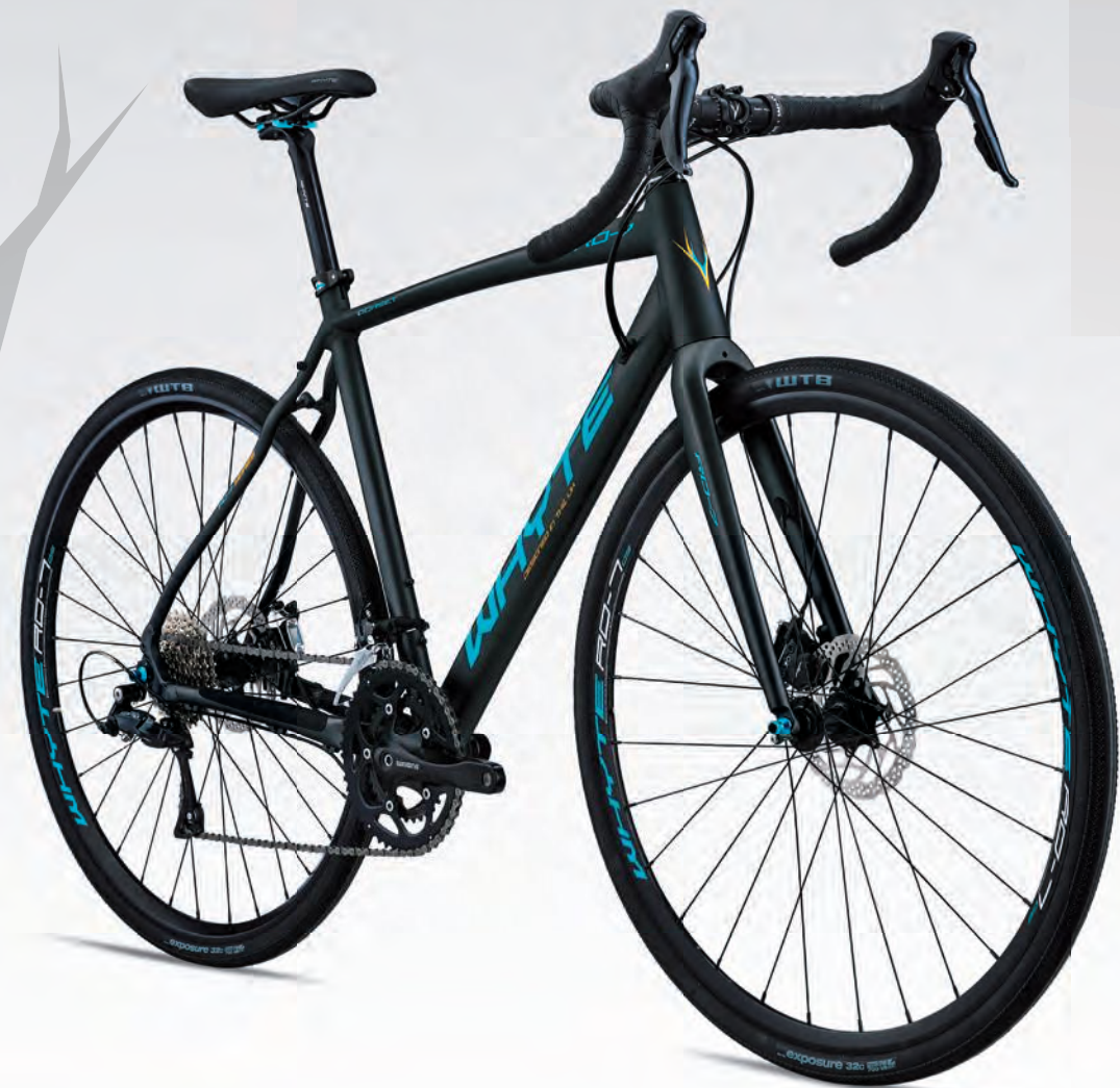
Disc-specific aluminium frame with carbon fibre fork / TRP HyRd mechanical/hydraulic disc brakes / Shimano Sora 9spd compact gearing with wide range rear cassette SPORTS ROAD/COMMUTER DISC - RD7 SERIES