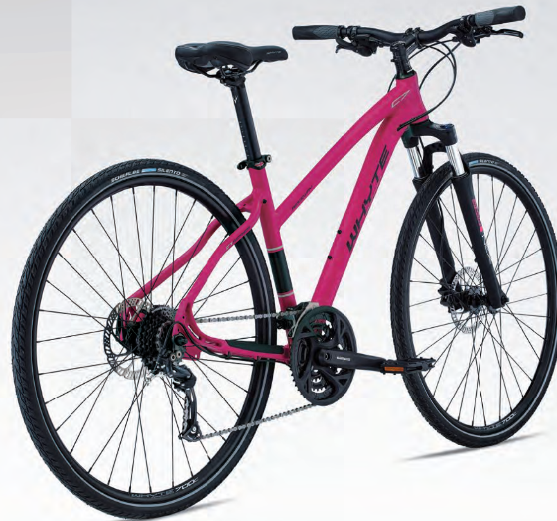
Lightweight aluminium frame / integrated kickstand mount / SR Suntour suspension fork with Hydro lockout / Shimano 3x9spd gearing / Schwalbe 37c Tyres / Tektro hydraulic disc brakes ALL TERRAIN/LEISURE - C7 SERIES