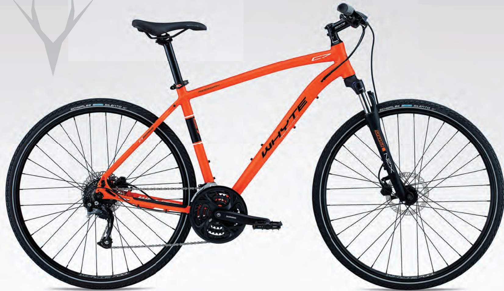
Lightweight aluminium frame / integrated kickstand mount / SR Suntour suspension fork with Hydro lockout / Shimano 3x9spd gearing / Schwalbe 37c Tyres / Tektro hydraulic disc brakes ALL TERRAIN/LEISURE - C7 SERIES