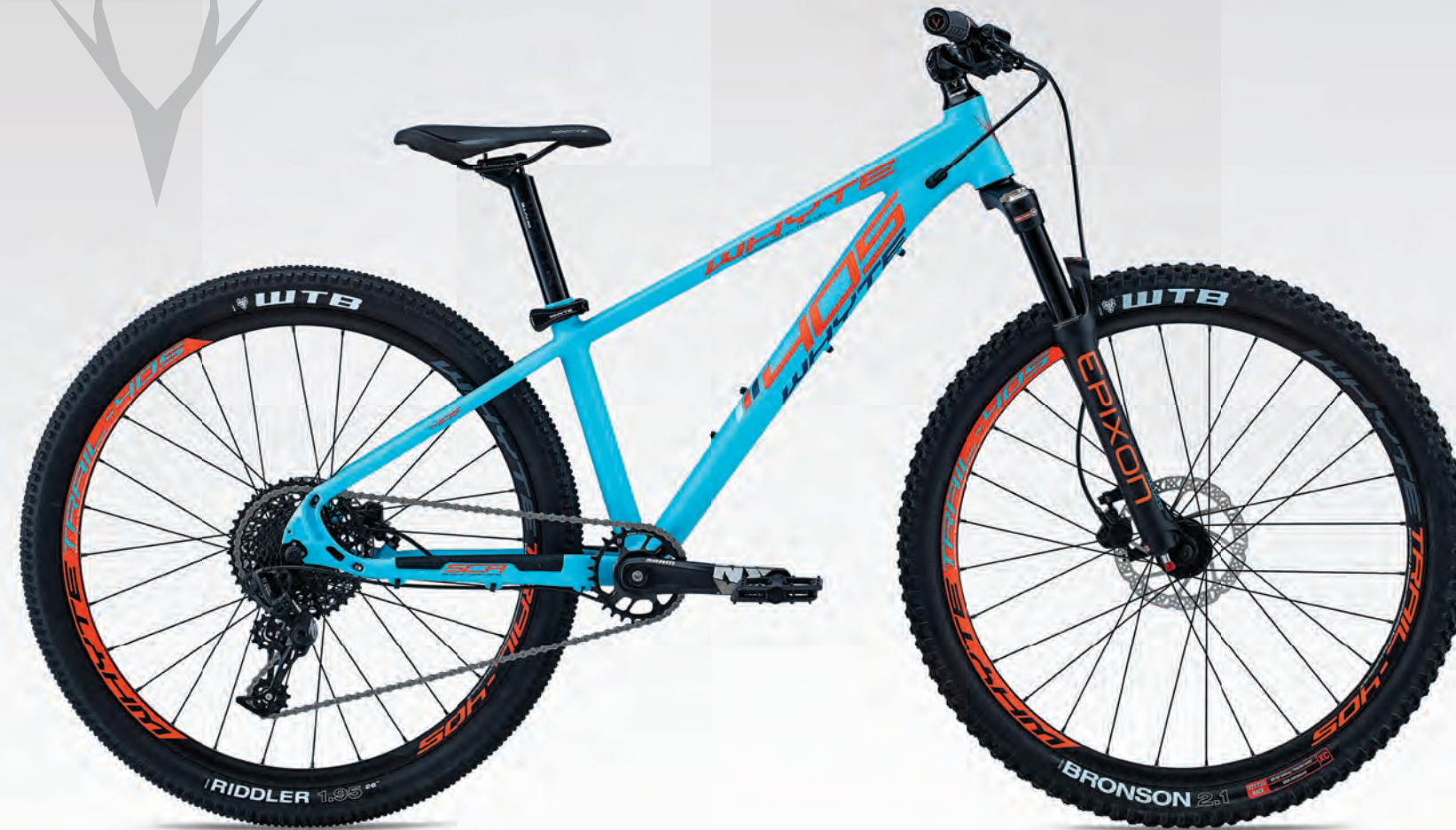
SRAM NX 1 by 11 drivetrain with NX Trigger shifter/ SR Suntour Epicon fork with adjustable air spring to tune to rider weight / Tailored front and rear tyres to exploit every ounce of grip and performance YOUTH 26ER TRAIL HARDTAIL - 400 SERIES - 100MM