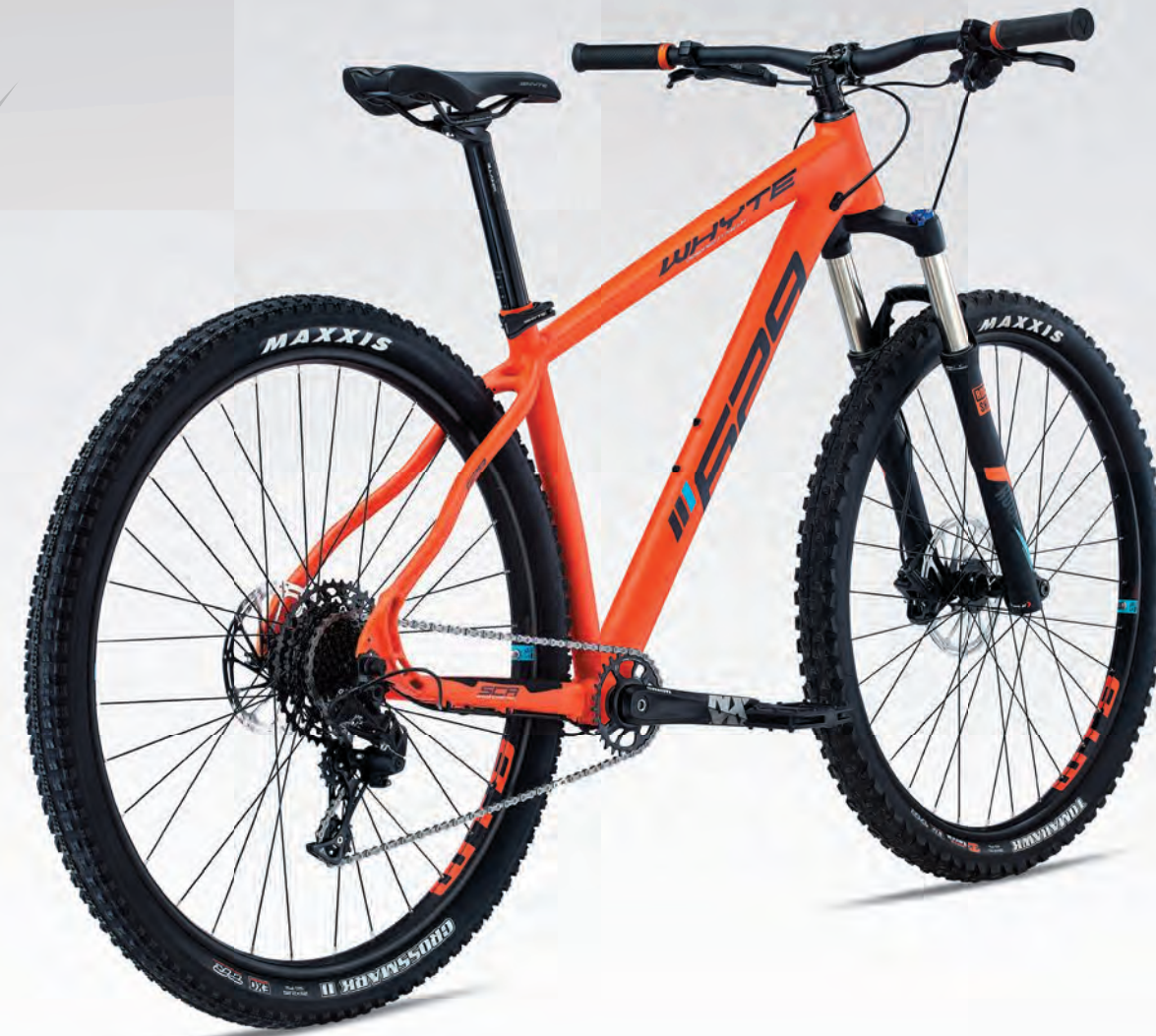
SRAM NX 1 by 11 drivetrain / RockShox Recon Silver TK air-sprung fork with 120mm of travel / Maxxis front and rear specific tyres TRAIL HARDTAIL 29ER - 120MM