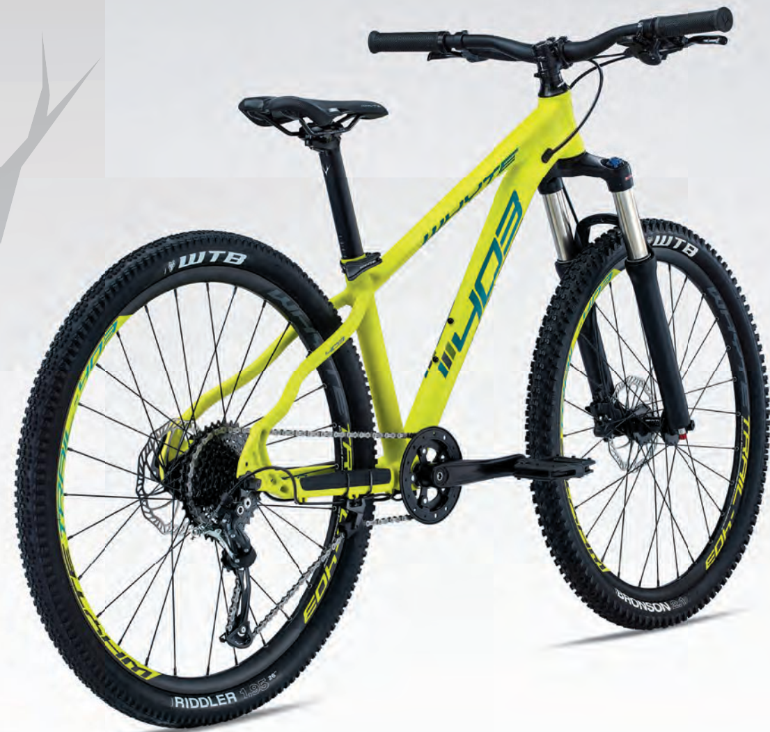
Lightweight aluminium frame with internal cable routing / SR Suntour XCM suspension 100mm fork with adjustable air spring to tune to rider weight / Shimano 1x9spd drivetrain / 11-40T Cassette / Trigger Shifter / Chainstay Guide, Narrow wide Chaining YOUTH 26ER TRAIL HARDTAIL - 400 SERIES - 100MM