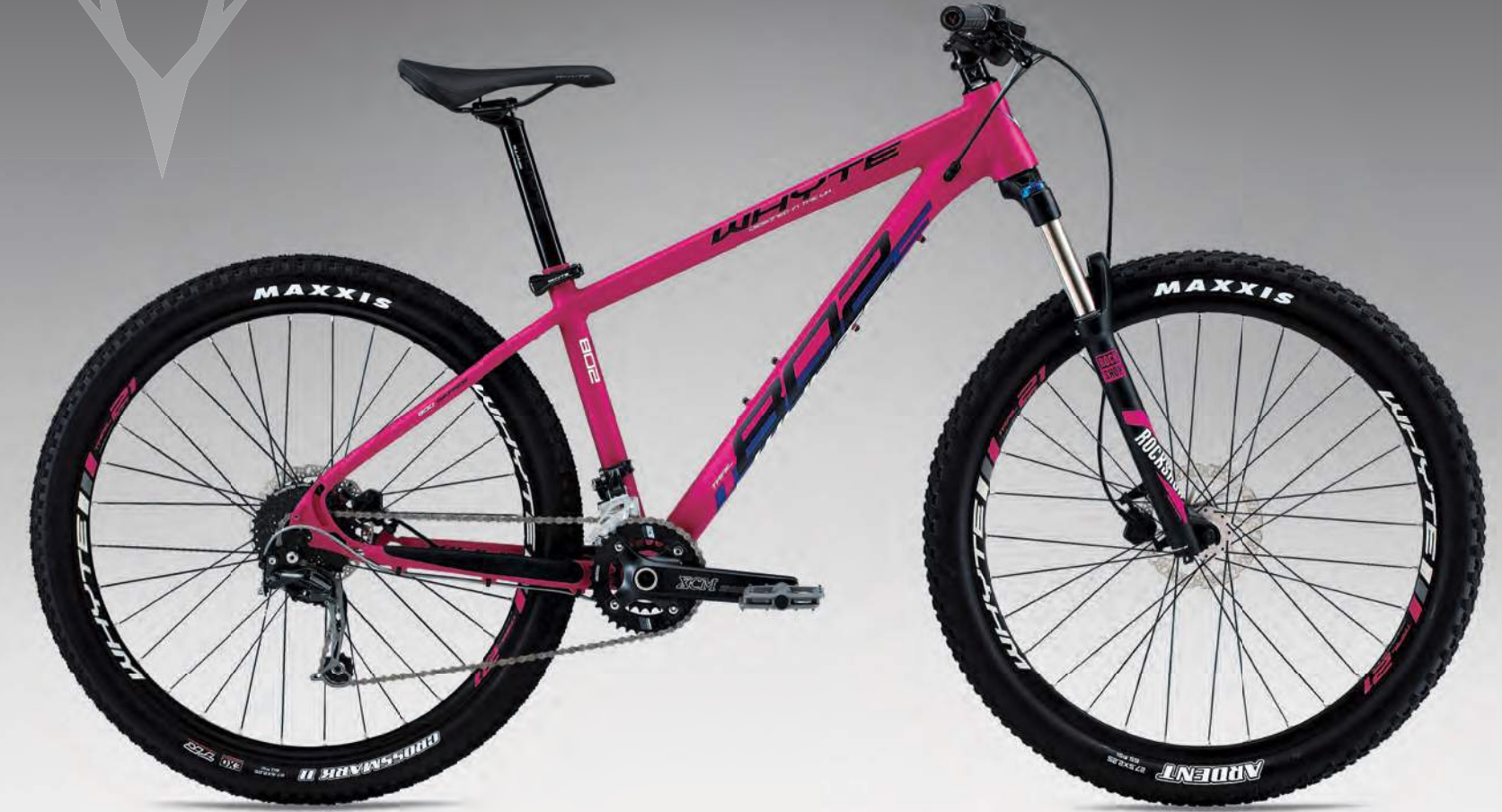
Compact geometry for riders with smaller proportions / Available in size XS / Shorter 170mm cranks as standard / Lightweight hydro formed aluminium frame TRAIL HARDTAIL - 800 SERIES - 120MM