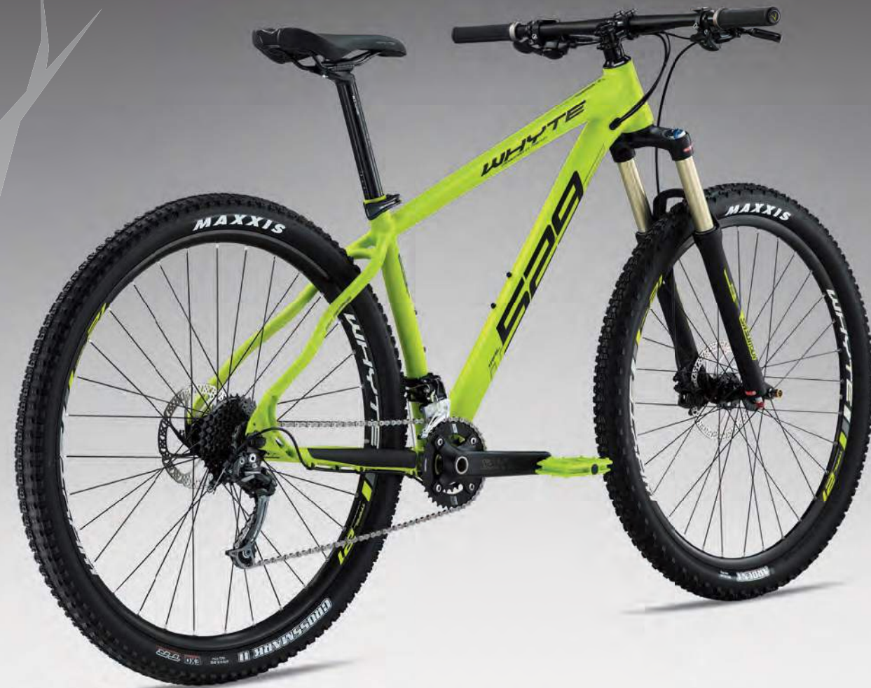
6061 Hydro Formed T6 Aluminium frame / Maxxis front and rear specific tyres / Shimano, SR Suntour 2x9spd drivetrain / SR Suntour Raidon front fork with 15mm through axle TRAIL HARDTAIL 29ER - 120MM