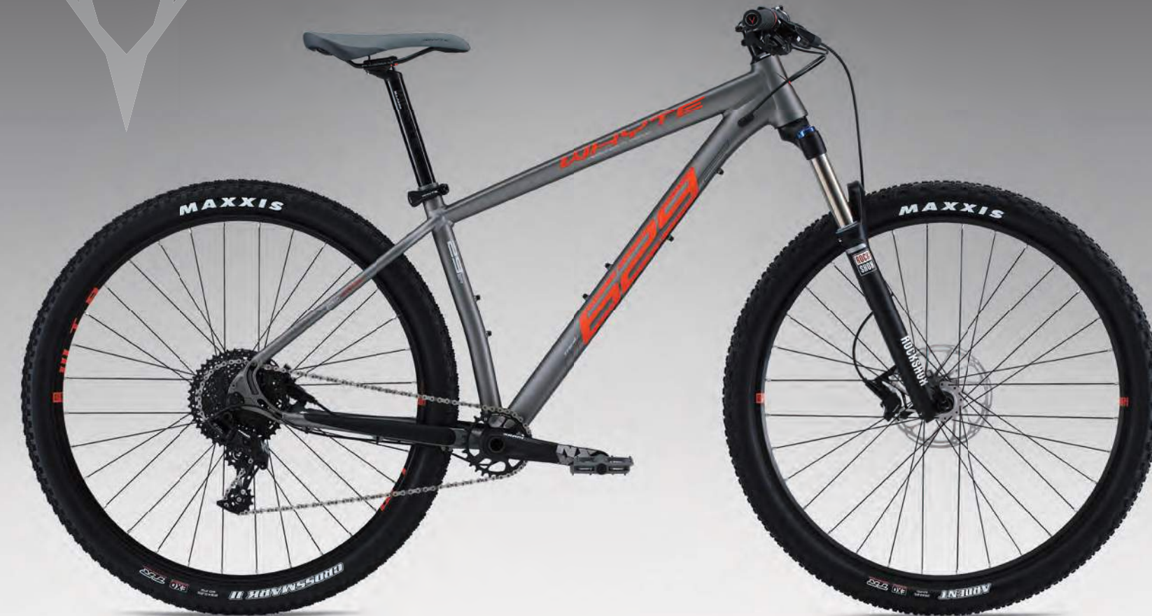
SRAM NX 1 by 11 drivetrain / RockShox Recon Silver TK air-sprung fork with 120mm of travel / Maxxis front and rear specific tyres TRAIL HARDTAIL 29ER - 120MM