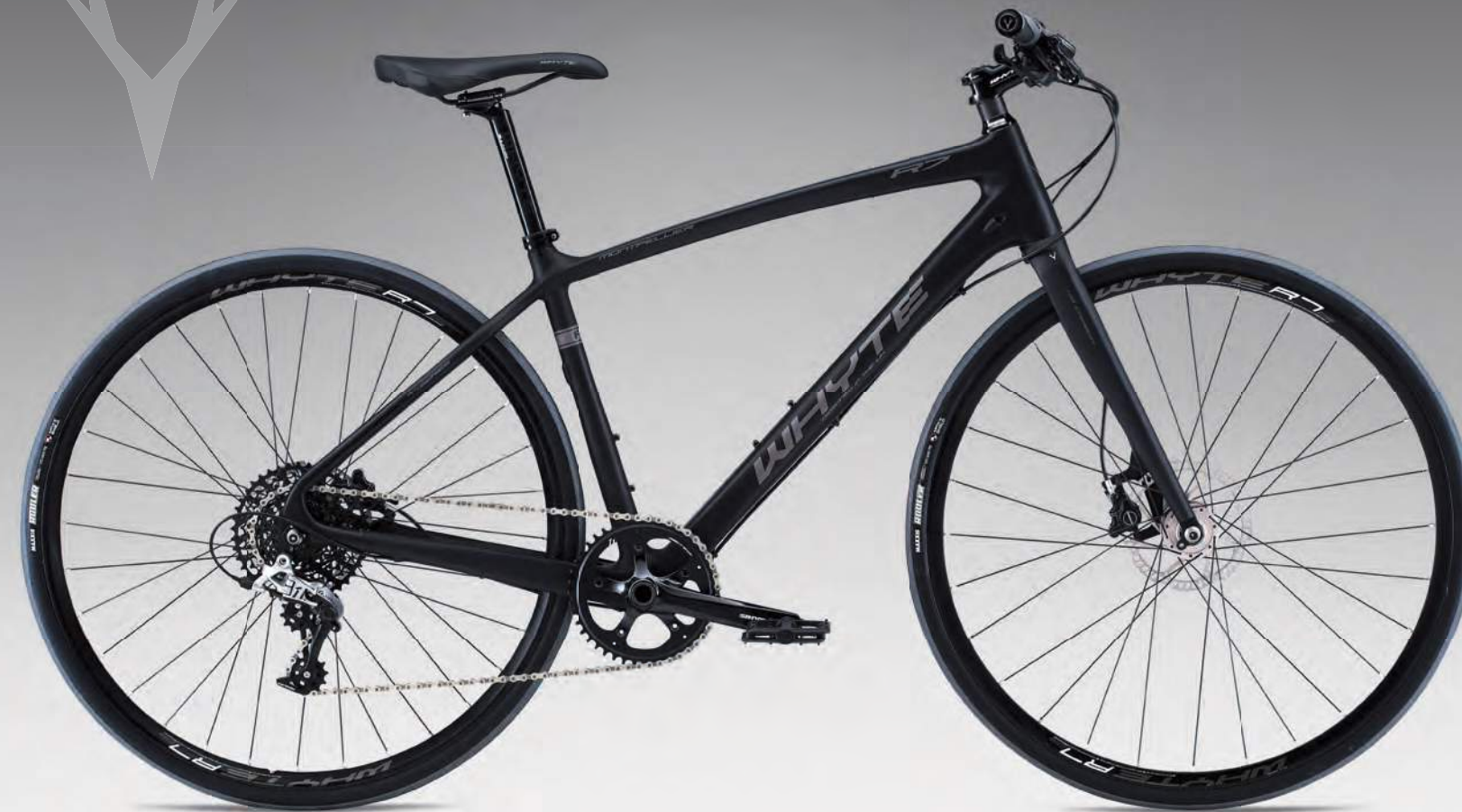
Full carbon frame is 300g lighter than aluminium / SRAM Rival 1, 1 by 11 groupset/ lightweight carbon fibre fork with internal cable routing FAST URBAN/COMMUTER - R7 SERIES