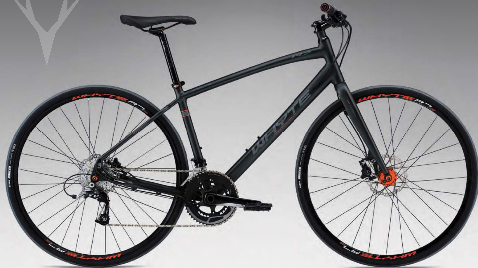
SRAM Rival 22 groupset / lightweight aluminium frame and carbon fibre fork / Powerful Tektro Gemini hydraulic disc brakes FAST URBAN/COMMUTER - R7 SERIES