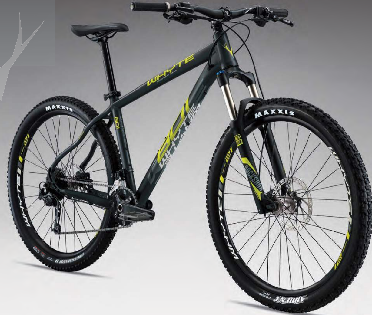
Shimano/SR Suntour 2 X 9spd drivetrain provides gears for all terrain / Maxxis front and rear specific tyres / RockShox 120mm 30 Silver fork with TurnKey lockout and Solo Air TRAIL HARDTAIL - 800 SERIES - 120MM