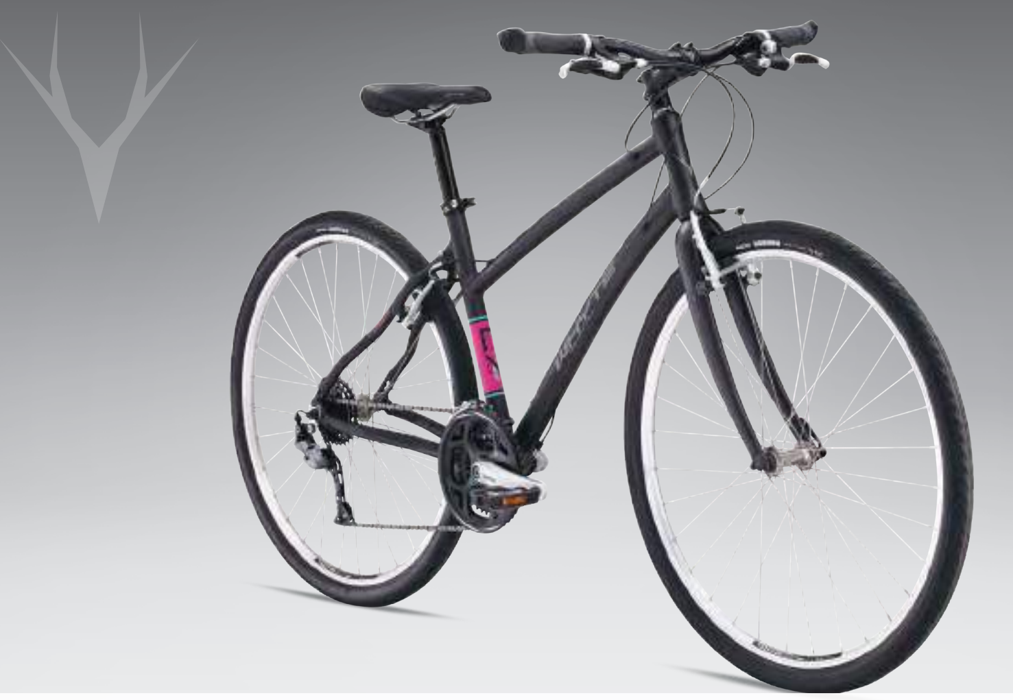
Partially dropped top tube is stronger than a fully dropped frame / Maxxis Roamer tyres with puncture protection / Wide-ratio Shimano gearing C7 ALL TERRAIN WOMEN'S