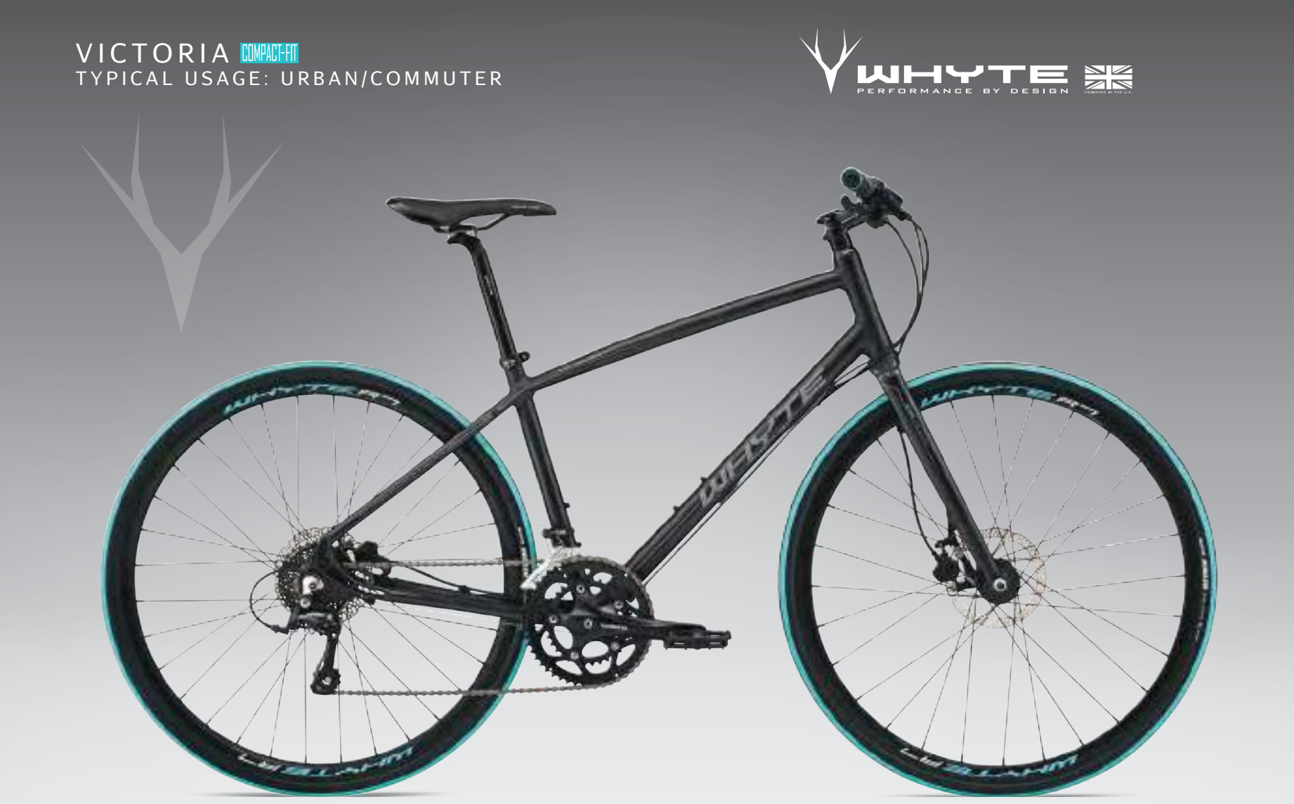
Lightweight aluminium frame with compact geometry / Shimano 2x9spd drivetrain / Maxxis Rouler tyres with MaxxShield puncture protection