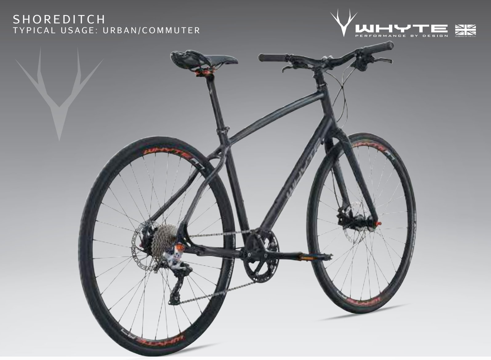
Lightweight aluminium frame / 1x10spd Shimano mountain bike gearing for city-proof performance / Reliable and powerful Tektro hydraulic disc brakes R7 FAST URBAN SERIES