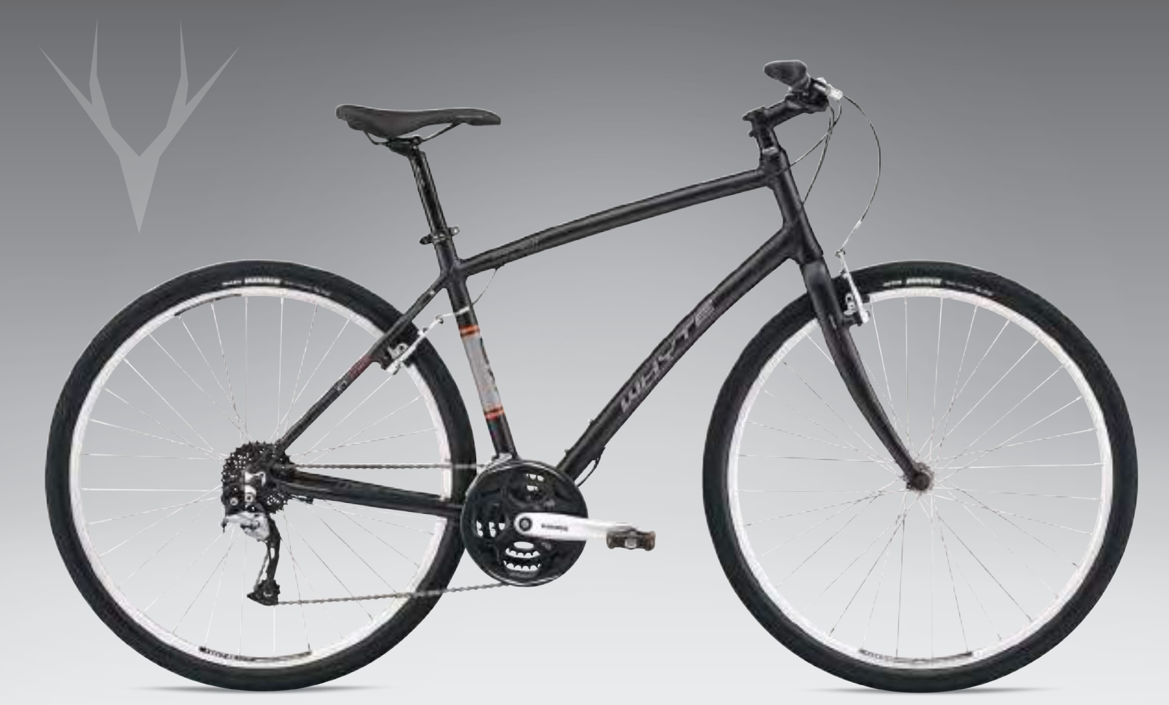
Lightweight aluminium frame / Maxxis Roamer tyres with puncture protection / Wide-ratio Shimano gearing / Powerful V-brakes C7 ALL TERRAIN SERIES