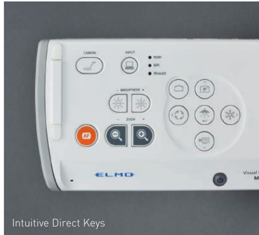
Intuitive Direct Keys