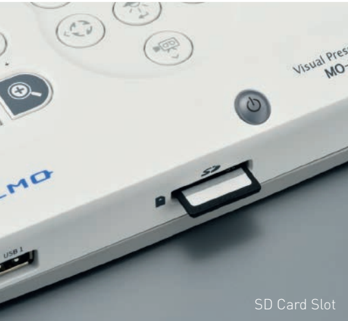
SD Card Slot