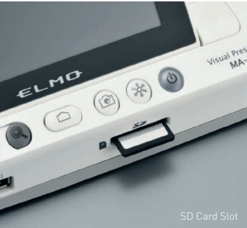
SD Card Slot