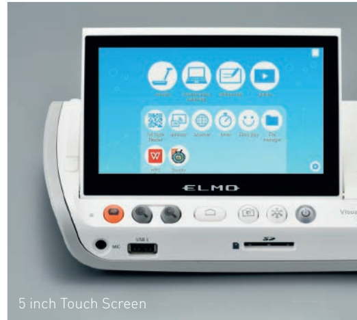
5 inch Touch Screen