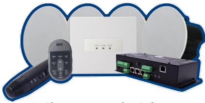
XD Classroom Audio Solution

Classroom Audio Solutions help them hear clearly