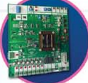
Diamond Control Board Easy to Use & State-of-the-art Advanced Features Come Standard Built-in Lightning & Surge Protection