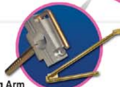
Quick-Release Swing Arm Simple & Secure No-Pinch Design for Added Safety