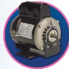
Motor Heavy Duty Instant Reversing Continuous Duty