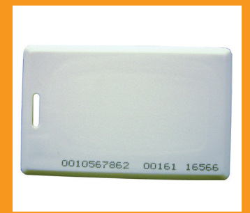
CARX-20 Accessory Access Card