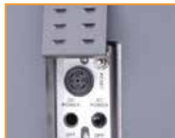
built in power and reset switches