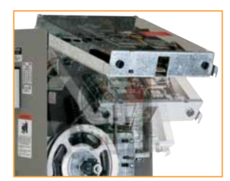
unique design allows easy access to all mechanical parts