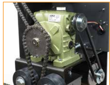
full size gearbox heavy-duty 30:1 ratio gearbox