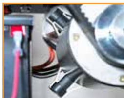
quadra drive DC motor for longer life