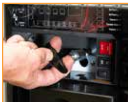
easy to use "T-Handle" release