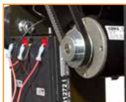
battery backup built-in (7.2 AH battery x2)