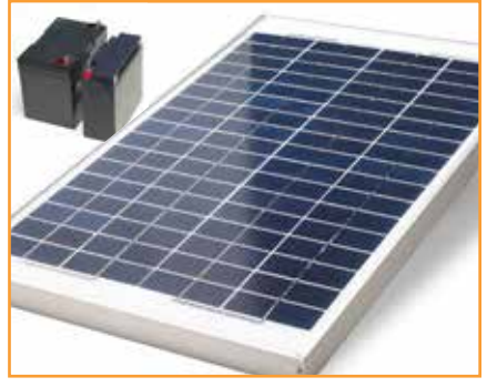
solar powered panel and battery options available