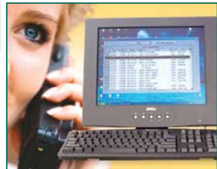
pc programmable easy to use Remote Account Manager software included