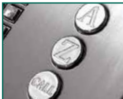
large scroll and call buttons