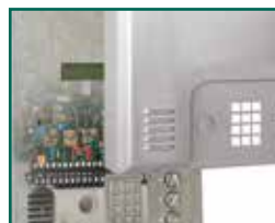
stainless steel plate and anti-vandal features