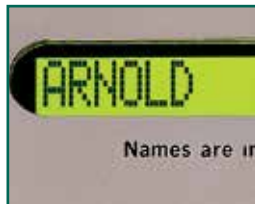
big characters half inch LCD display