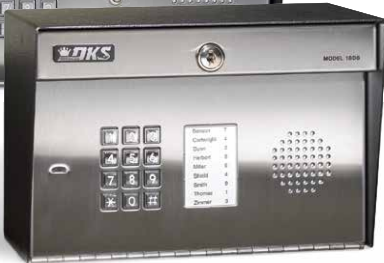
surface mount with built in directory/message window