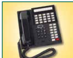
dtmf tone output useable with PBX, KSU and telephone systems with auto-attendants