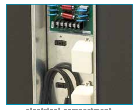
electrical compartment for 4 accessory transformers, and mounting space for surge suppressors and an access control radio receiver