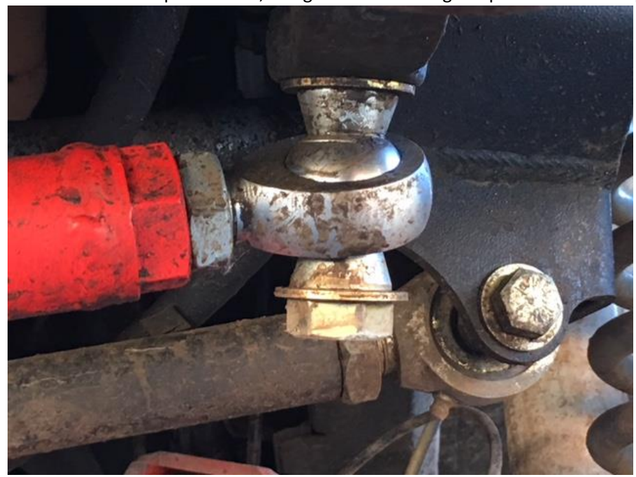
Under the Knuckle (UTK)

Now the final connection on the pitman arm, using the 4" bolt using the picture below for proper order.