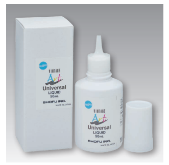
Vintage Art Universal Liquid