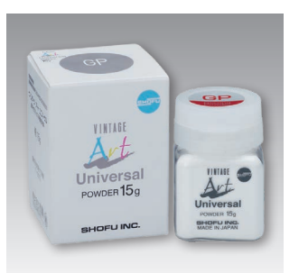
Glazing Powder GP 15q - PN 0691