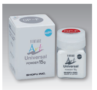
Fluorescent Glazing Powder GP-F