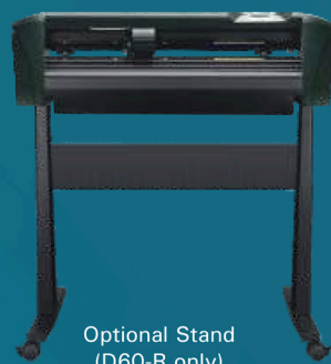
Optional Stand (D60-R only)