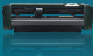
Desktop Model (D60-R only)