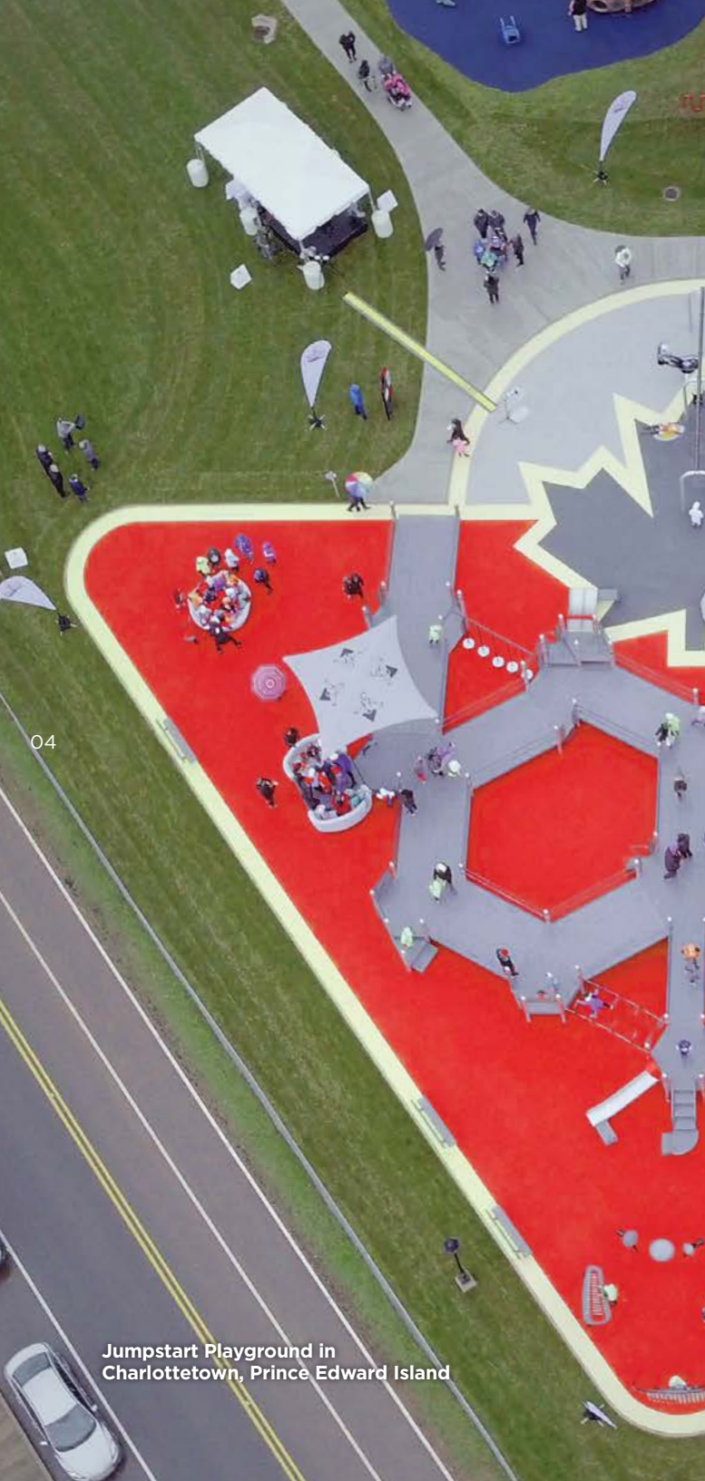
Jumpstart Playground in Charlottetown, Prince Edward Island