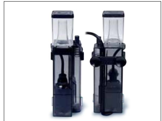
MINI SKIMMER 115