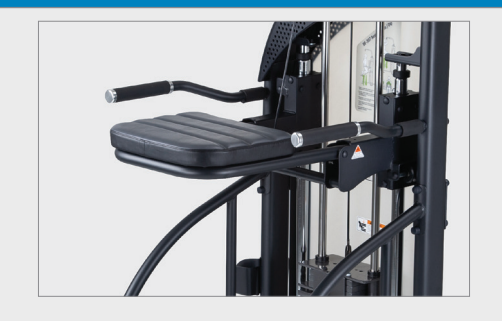
Integrated weight assist platform offsets the users body weight while doing dips or pull-ups, maximizing reps and reducing fatigue