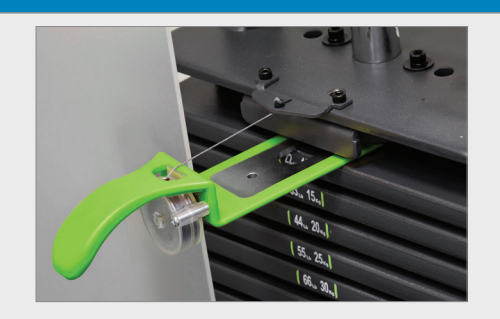
Our stacks feature sound dampeners and magnetized selector fork for maximum stability.