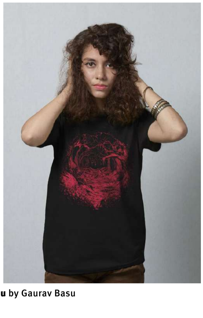
Come In... Won't You by Gaurav Basu