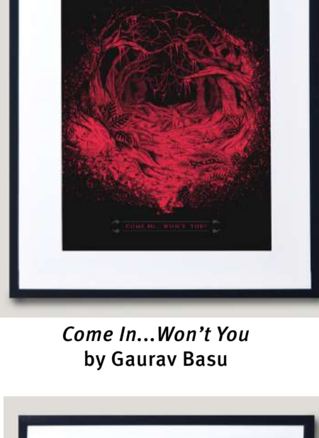
Come In... Won't You by Gaurav Basu

To dream is to allow the mind to wander with no boundaries or limitations. Our artists explore their own dreams, experiences, hopes, fears, comedies and tragedies.