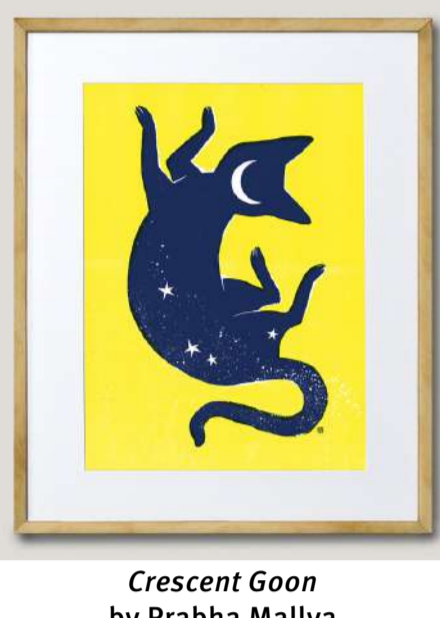
Crescent Goon by Prabha Mallya