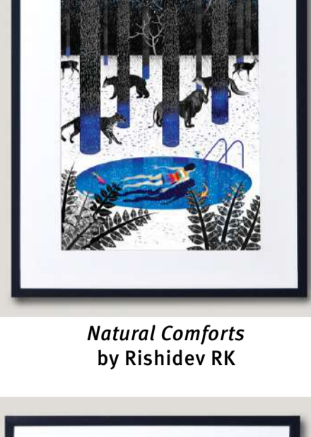
Natural Comforts by Rishidev RK