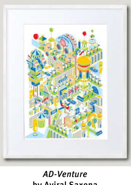
AD-Venture by Aviral Saxena