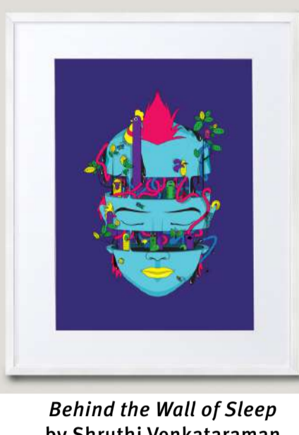
Behind the Wall of Sleep by Shruthi Venkataraman