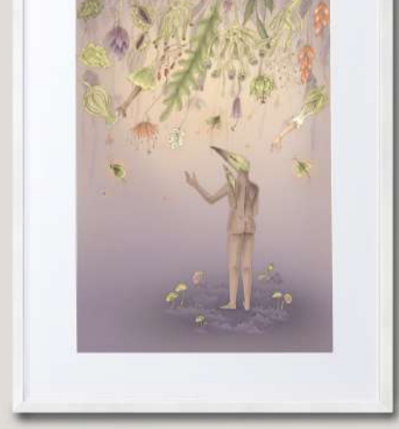
Twilight Greens by Janine Shroff