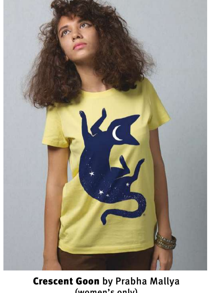
Crescent Goon by Prabha Mallya (women's only)