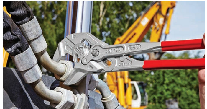
16" Pliers Wrench for large applications up to 3 3/8"