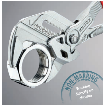
Smooth jaws can be applied directly to chrome surfaces