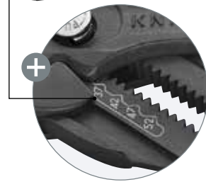
Laser-etched scale for pre-setting of width across flats