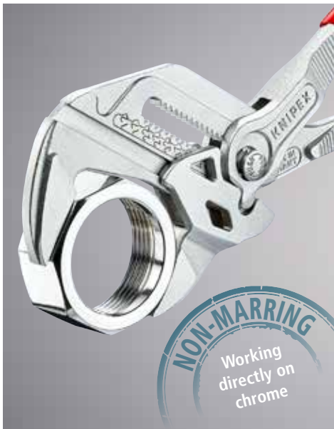
Smooth jaws can be applied directly to chrome surfaces