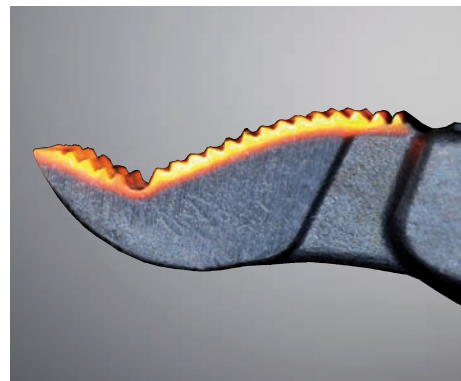
Induction hardened teeth for long life