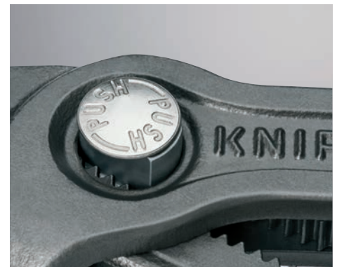
Push-button adjustment locks in place until you reset it