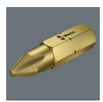
A stands for aviation. A bits are particularly hard bits with a sharpedged profile which e.g. penetrates screw profiles full of paint (such as on fuselage panels) ensuring a dependable transfer of force between the bit and the screw.