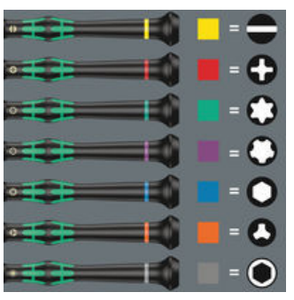
Screwdrivers with "Take it easy" tool finder: colour coding according to profile and size stamp.