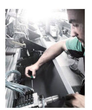
Screwdriving jobs in electrical and precision engineering applications are often tedious and timeconsuming. We learned from users what is important for them: working speeds, torque, precision - and we then focused particularly on these issues.