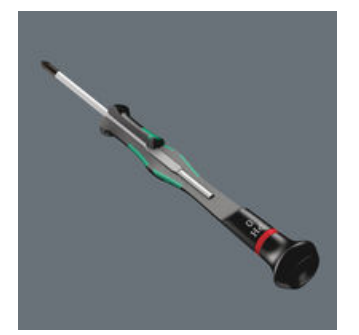
Multi-component screwdriver handle for ergonomic working.