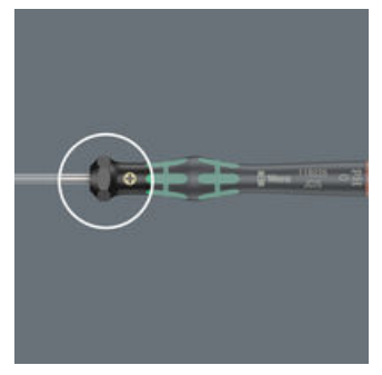
The precision zone directly above the blade gives the user a better feel for the right rotation angle during fine adjustment work.