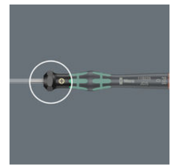
The precision zone

The precision zone directly above the blade gives the user a better feel for the right rotation angle during fine adjustment work.