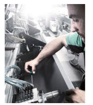
Screwdriving jobs in electrical and precision engineering applications are often tedious and timeconsuming. We learned from users what is important for them: working speeds, torque, precision - and we then focused particularly on these issues.