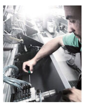
Screwdriving jobs in electrical and precision engineering applications are often tedious and timeconsuming. We learned from users what is important for them: working speeds, torque, precision - and we then focused particularly on these issues.