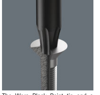
The Wera Black Point tip and a refined hardening process ensure long service life of the tip, improved corrosion protection and an exact fit.