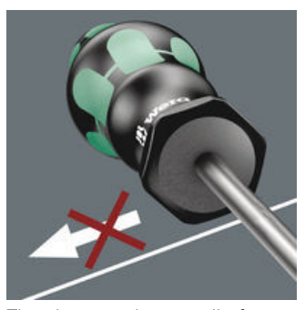
The hexagonal non-roll feature prevents any rolling away at the workplace.