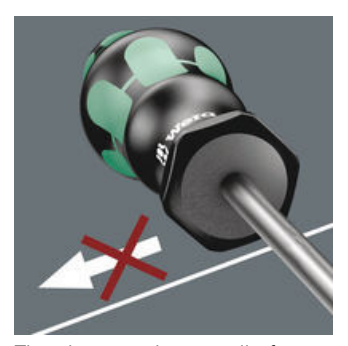
The hexagonal non-roll feature prevents any rolling away at the workplace.