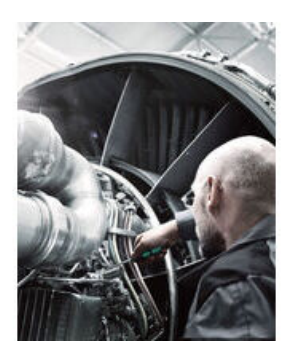
Kraftform Plus screwdrivers ergonomics you can grasp. They relieve the entire hand-arm system even when used intensively. Along with other technical and product advantages such as the Lasertip for a secure fit in the screw head, Kraftform screwdrivers are the ideal choice whenever manual screwdriving jobs are concerned.