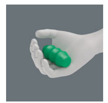
The basic idea for the prototype of the Kraftform handle - that the hand should dictate the design has, right through to today, proved to be correct. In cooperation with the internationally recognised Fraunhofer IAO Institute, Wera developed a screwdriver handle designed to match the shape of the human hand as long ago as 1960s. After a long the development phase, the Wera Kraftform handle was launched to the market in 1968. It has been optimised through the years with new technologies, but has kept its proven shape. After all, the human hand has not changed either.