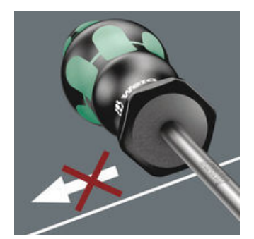
The hexagonal non-roll feature prevents any rolling away at the workplace.