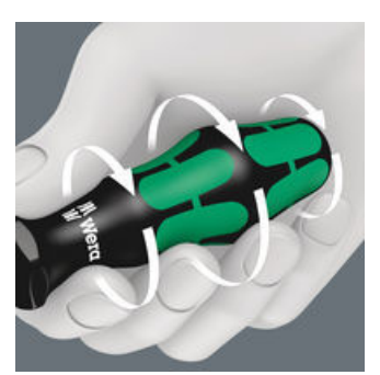
The hard materials used for the handle ensure rapid hand repositioning without any danger of the skin "sticking" to the handle. The surrounding hard zones with large diameters glide like wheels through the hand.