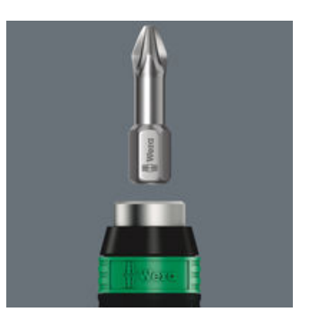
Rapidaptor technology makes the tool adaptable since bits and sockets can be exchanged rapidly.

Web link https://products.wera.de/en/torque_tools_series_7400_kraftform_torque_screwdrivers_with_a_factory_pre-set_measurement_value_7400_pre-set_89_mm.html