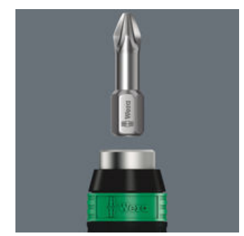
Rapidaptor technology makes the tool adaptable since bits and sockets can be exchanged rapidly.