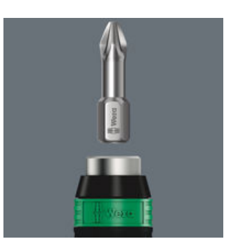
Rapidaptor technology makes the tool adaptable since bits and sockets can be exchanged rapidly.

Web link https://products.wera.de/en/torque_tools_series_7400_kraftform_torque_screwdrivers_with_a_factory_pre-set_measurement_value_7400_pre-set__105_mm.html