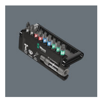
The Bit-Checks can be positioned upright at the workplace so the tool is always quickly to hand.