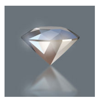
Another product advantage is the coating of the Impaktor bits with minute diamond particles.