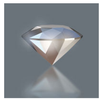
Another product advantage is the coating of the Impaktor bits with minute diamond particles.