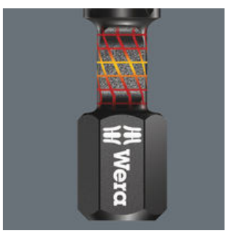
Torsion zone specially designed to absorb such forces and thereby protect the bit tip.