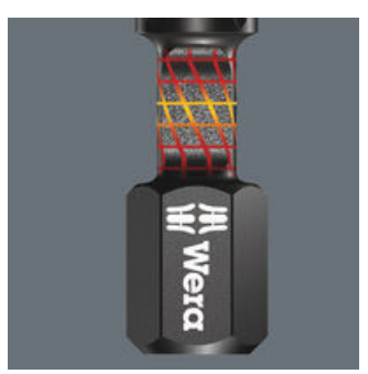
Torsion zone specially designed to absorb such forces and thereby protect the bit tip.