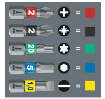
"Take it easy" tool finder with colour coding according to profiles and size stamp - for simple and rapid accessing of the required tool.