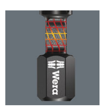
Torsion zone specially designed to absorb such forces and thereby protect the bit tip.