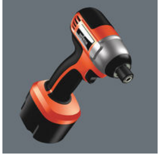
For use with impact screwdrivers. Improve productivity screwdriving with power tools.