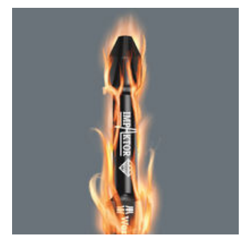
Maximum utilisation of the material properties, a very special geometry - designed particularly to meet the extreme demands - as well a specific manufacturing process mean that Wera Impaktor tools have an above-average service life.