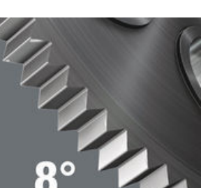
Fine action 44 tooth system for precision work. Great time savings when screwdriving.