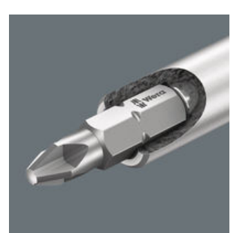
With stainless steel sleeve and strong permanent magnet.