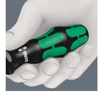
The outstanding design of the Kraftform handle that fits perfectly into the hand prevents hand injuries such as blisters and calluses.