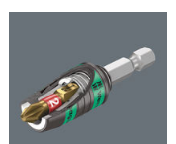
Special design powerful ring magnet, for larger and heavier screws. Ideal for overhead work, too.