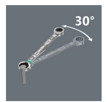
Instead of 60°, the Joker only has a 30° back-pivoting angle thanks to its unique double-hex design. Along with the Joker's straight neck, this means that flipping the wrench has become a thing of the past. With the Joker, you can now loosen and tighten nuts and bolts, in situations where conventional tools fail. Particularly in confined spaces, where conventional openjawed wrenches cannot be used. The combination of limit stop and small return angle enables eff ective work, even on screw pipe connections.

Further versions in this product family: