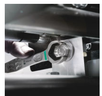
When we began to think about open-ended wrenches, we asked ourselves: why does the wrench always have to be flipped over; why does it have an offset design; why does it slip off injuring fingers? The new design of the open end resulted in a real "Joker" that works even when all other trumps have been played.