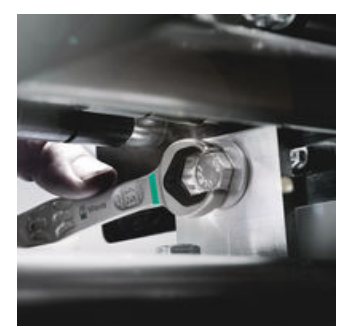
When we began to think about open-ended wrenches, we asked ourselves: why does the wrench always have to be flipped over; why does it have an offset design; why does it slip off injuring fingers? The new design of the open end resulted in a real "Joker" that works even when all other trumps have been played.