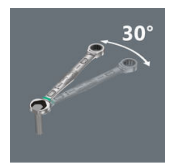
Instead of 60°, the Joker only has a 30° back-pivoting angle thanks to its unique double-hex design. Along with the Joker's straight neck, this means that flipping the wrench has become a thing of the past. With the Joker, you can now loosen and tighten nuts and bolts, in situations where conventional tools fail. Particularly in confined spaces, where conventional openjawed wrenches cannot be used. The combination of limit stop and small return angle enables eff ective work, even on screw pipe connections.