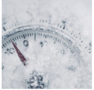
The stainless steel tools from Wera are vacuum ice-hardened and have the hardness and strength needed for screw connections. There are no limitations to the industrial applications they are suitable for.