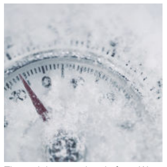
The stainless steel tools from Wera are vacuum ice-hardened and have the hardness and strength needed for screw connections. There are no limitations to the industrial applications they are suitable for.