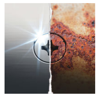
Wera stainless steel bits are manufactured out of stainless steel so unsightly rust can be avoided. The stainless steel bits from Wera are vacuum ice-hardened and have the hardness and strength needed for screw connections. There are no limitations to the industrial applications they are suitable for.